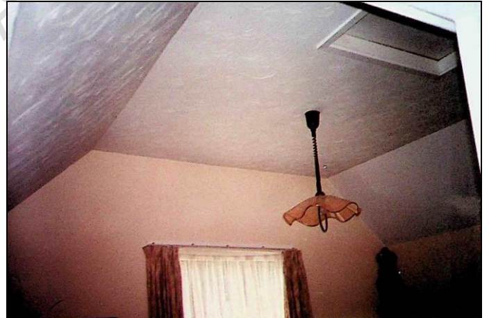
December 2001, JCNA

The Barracks are currently divided into three semi-detached dwellings and privately owned.