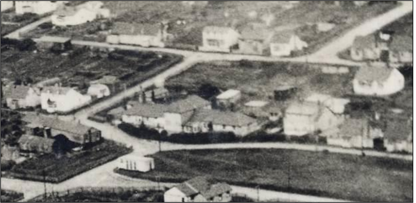
Late 1940s