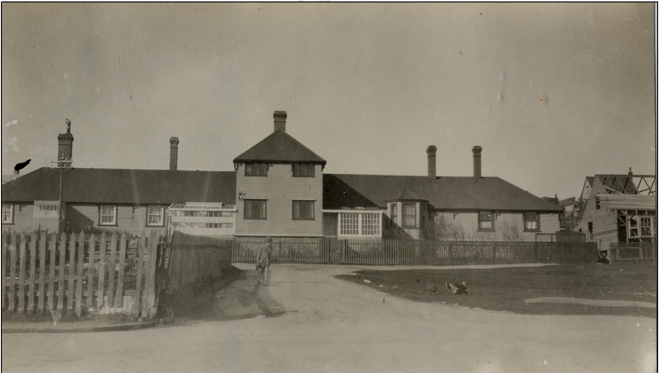
"The Court House" – FIC Collection, JCNA