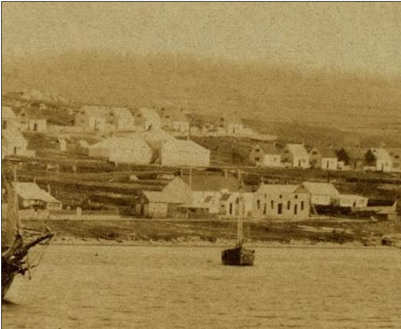
The Barracks (large central building), 1863

1857: “The wooden barracks built for the Pensioners on their arrival have been divided into 16 rooms, 10 feet square, with two fireplaces common to all. On the arrival of the Soldiers a single room was allotted to each family but I am endeavouring to give two rooms to each family...” The Falkland Islands Garrison arrived 12 January 1858 on board the Ealing Grove . [B10; 293: SHI-REG-1]