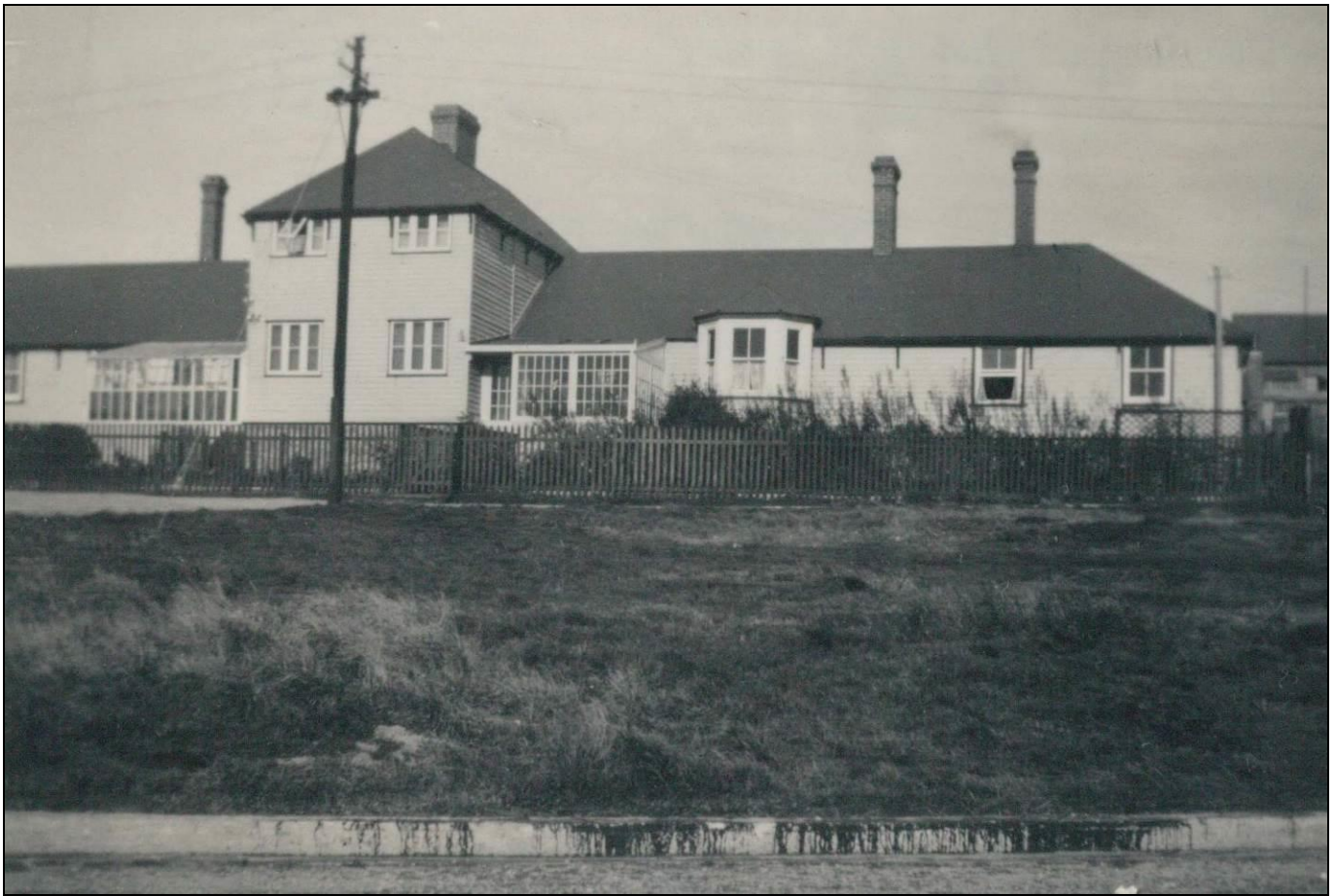
Durose Collection, JCNA