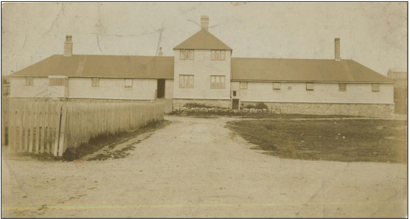
Circa 1900. Schoolmaster's house left wing, doctor's house centre two storeys, infant school right wing