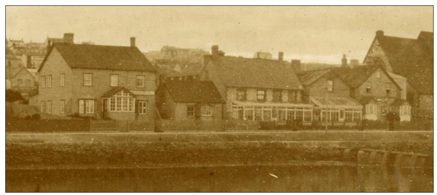
Pre 1944 showing the addition of a porch (L-R Ross House, 34 Ross Road with wooden lean-to; 33 Ross Road, Orchid Store, Hambledon House (partly obscured), Exchange Building)

In January 1938 the Agricultural Department moved from office in the Town Hall to Mr J W Miller's stone house on Ross Road.