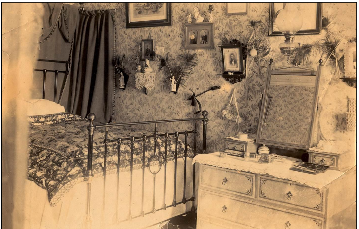
One of the bedrooms