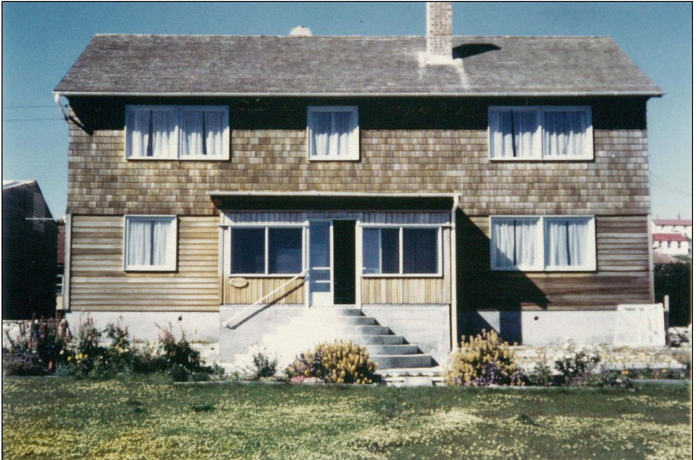
The Colt House