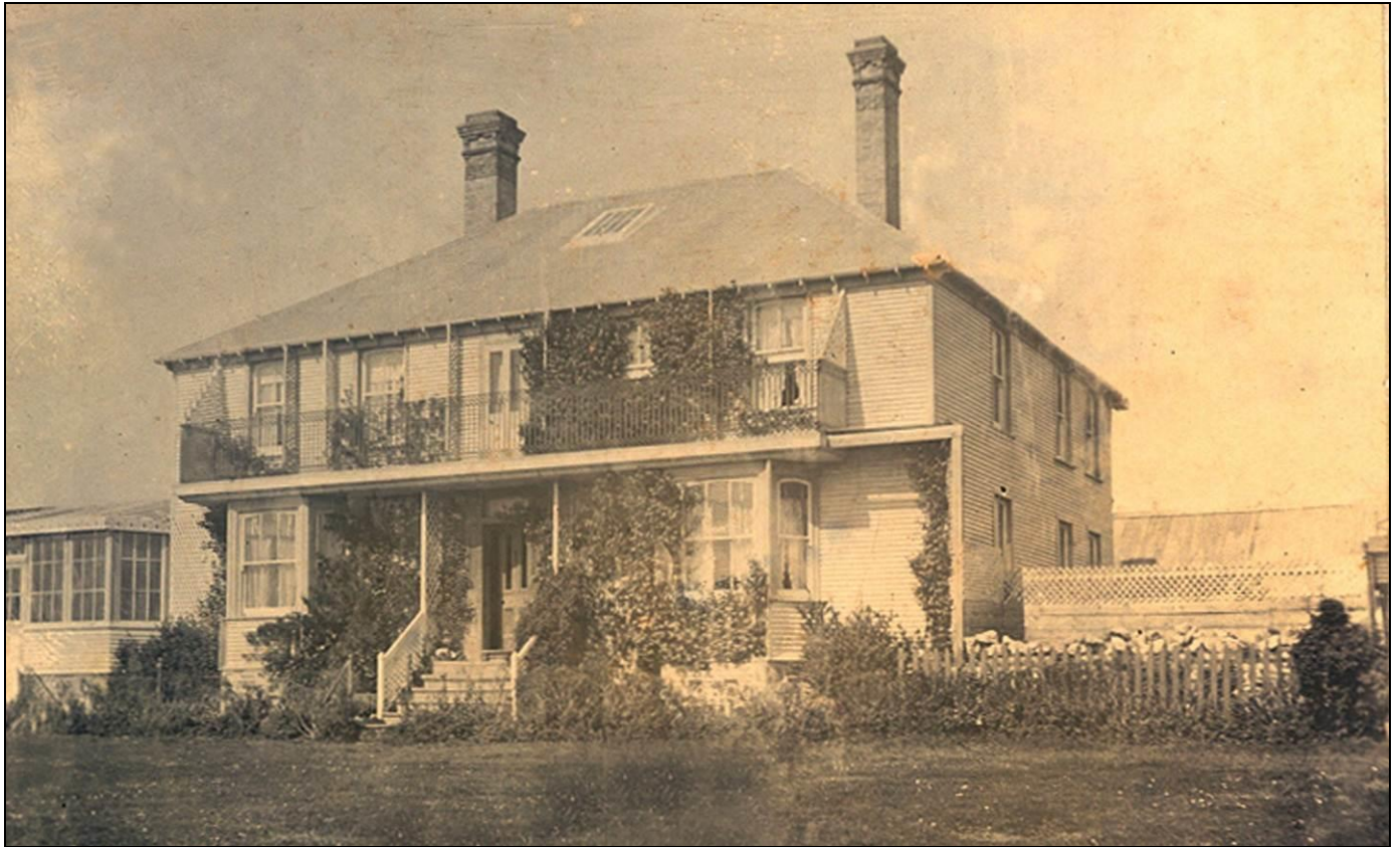
Malvina House circa 1900