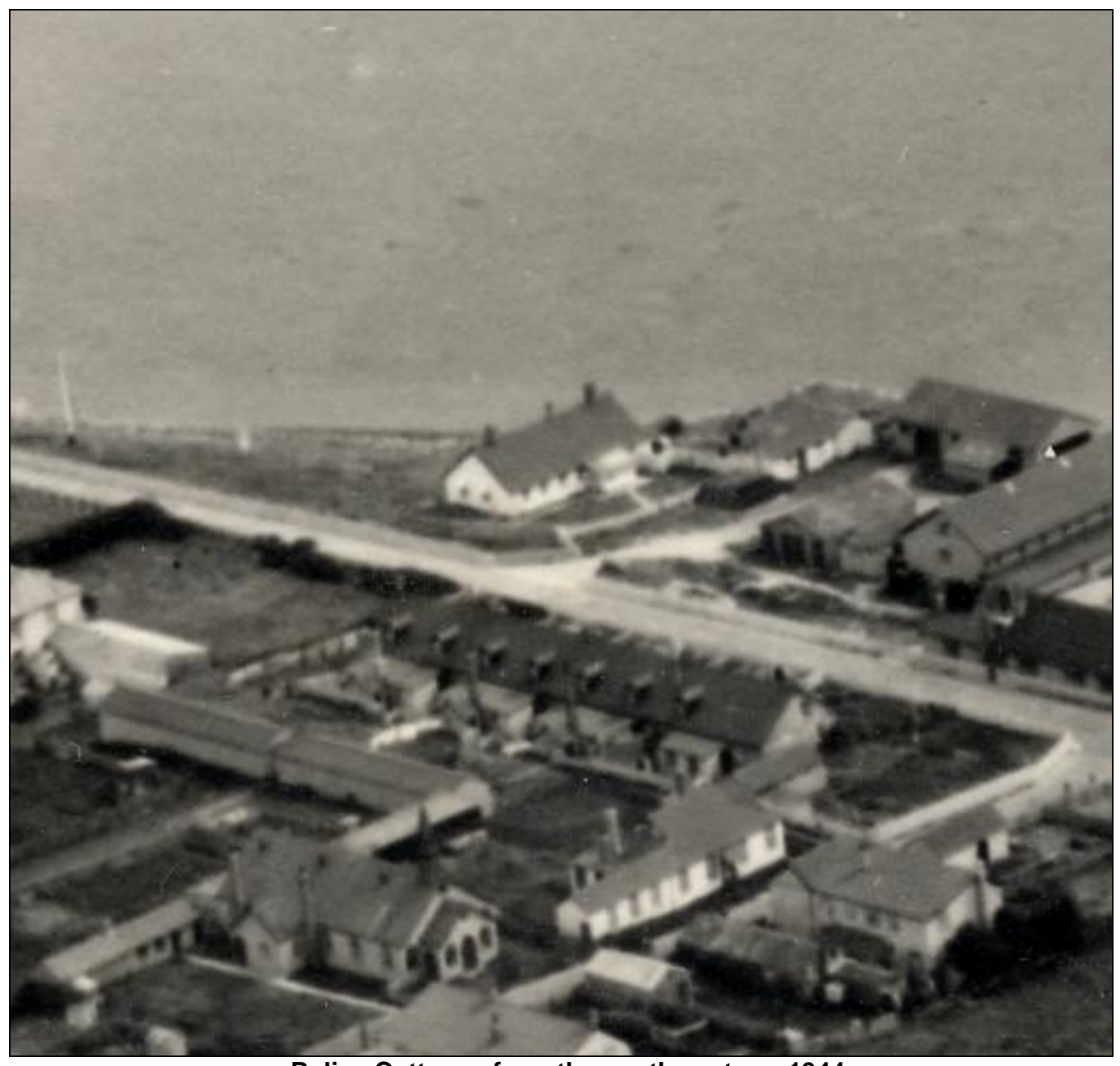
Police Cottages from the south east pre 1944

In 1913 they were generally repaired, upstairs rooms were partitioned, new wooden kitchens were built on, yards were concreted and lavatories were removed and placed within the peat sheds.