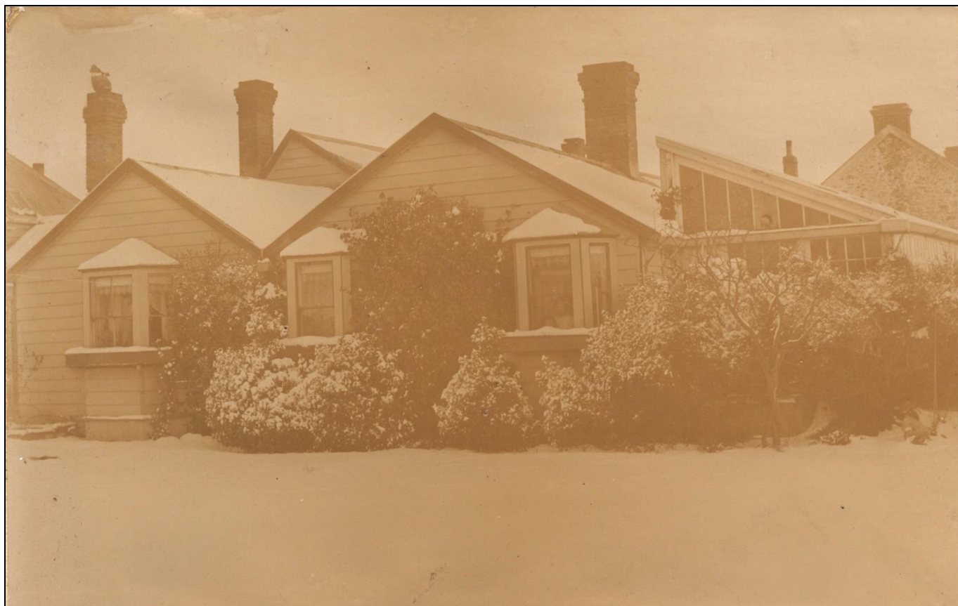
Stanley Cottage from the east, winter 1895

STANLEY COTTAGE VERSION: 1 September 2017