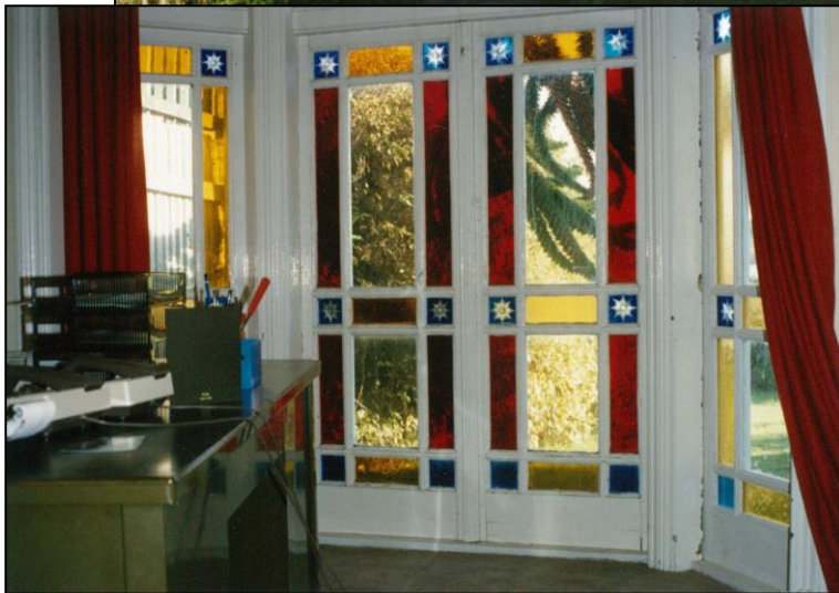
Stained glass in front windows