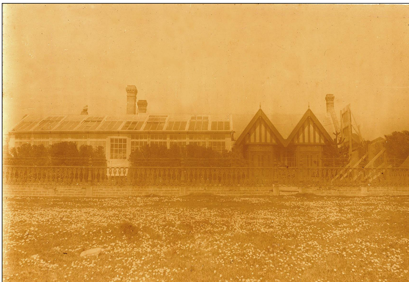
Stanley Cottage from the north