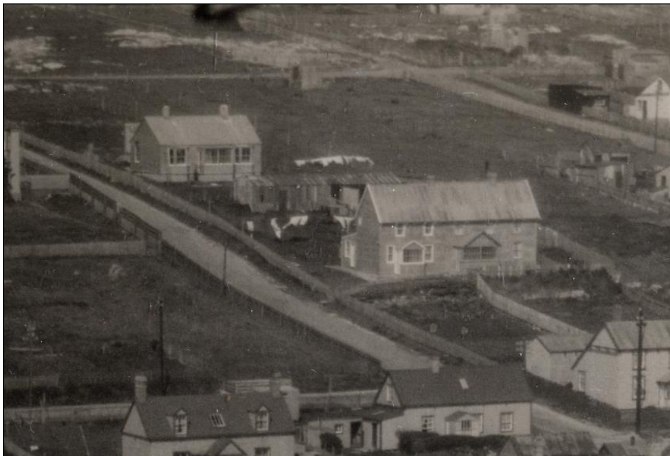
1936 - House centre right