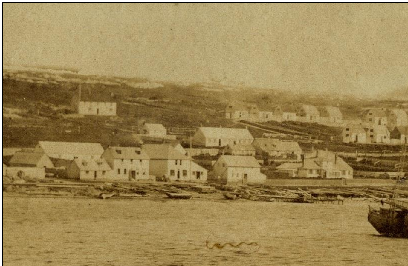
1863 - House top left