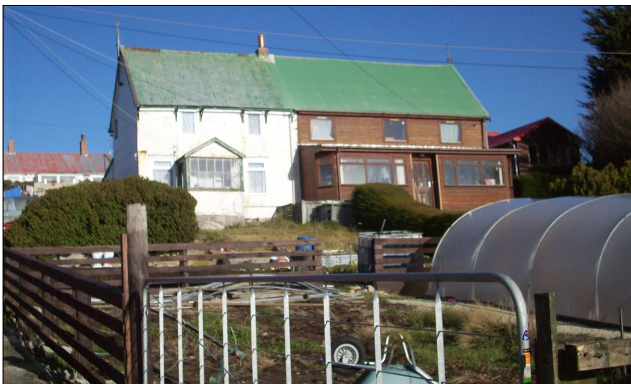
2019 - JCNA

On 28 January 1956 Markham James LUXTON of Stanley granted to the Falkland islands Government the eastern portion of Crown Grant 126 containing quarter of an acres more or less and bounded " on the North by Lot No 15 in the holding of Terence William Binnie 69 ½ links; on the West by part of Lot No 13 in the holding of Victorina Energy Paice 37 ½ links; on the South by part of Lot No 13 in the holding of Martin W H Biggs 69 ½ links; on the East by Villiers St 371 ½ links; together with dwelling house and all erections thereon free from all encumbrances. A Right of Way of 10 feet wide on the Northern boundary to be reserved to give access from Villiers Street to the land in the holding of Mrs V E Paice" for £650. [Vol XIV; pg 137]