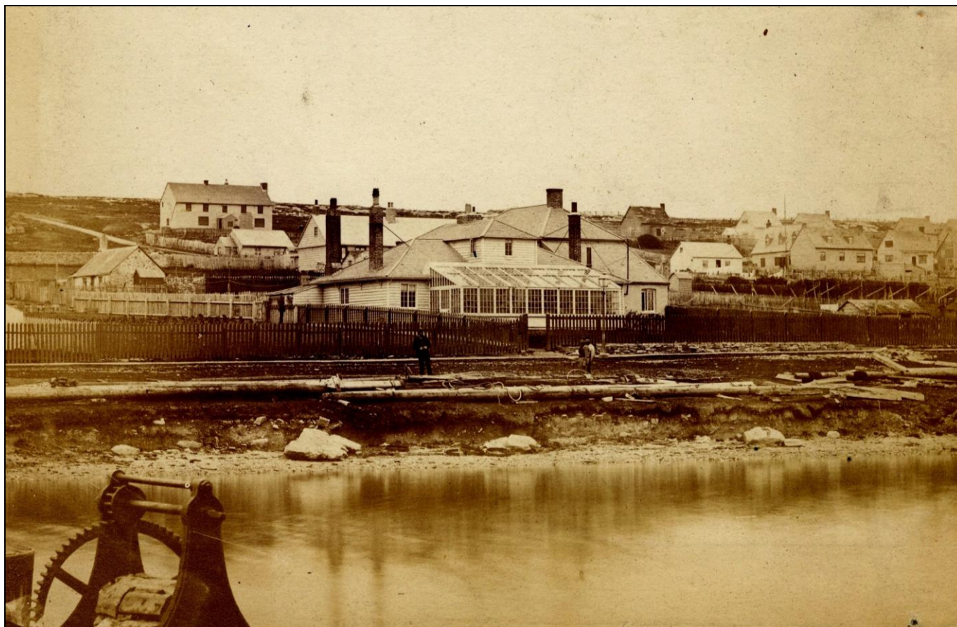
1875 - House top left - FIC Collection, JCNA

shares and his children to have the remaining shares divided equally between them. [BUG-REG-1; 353]