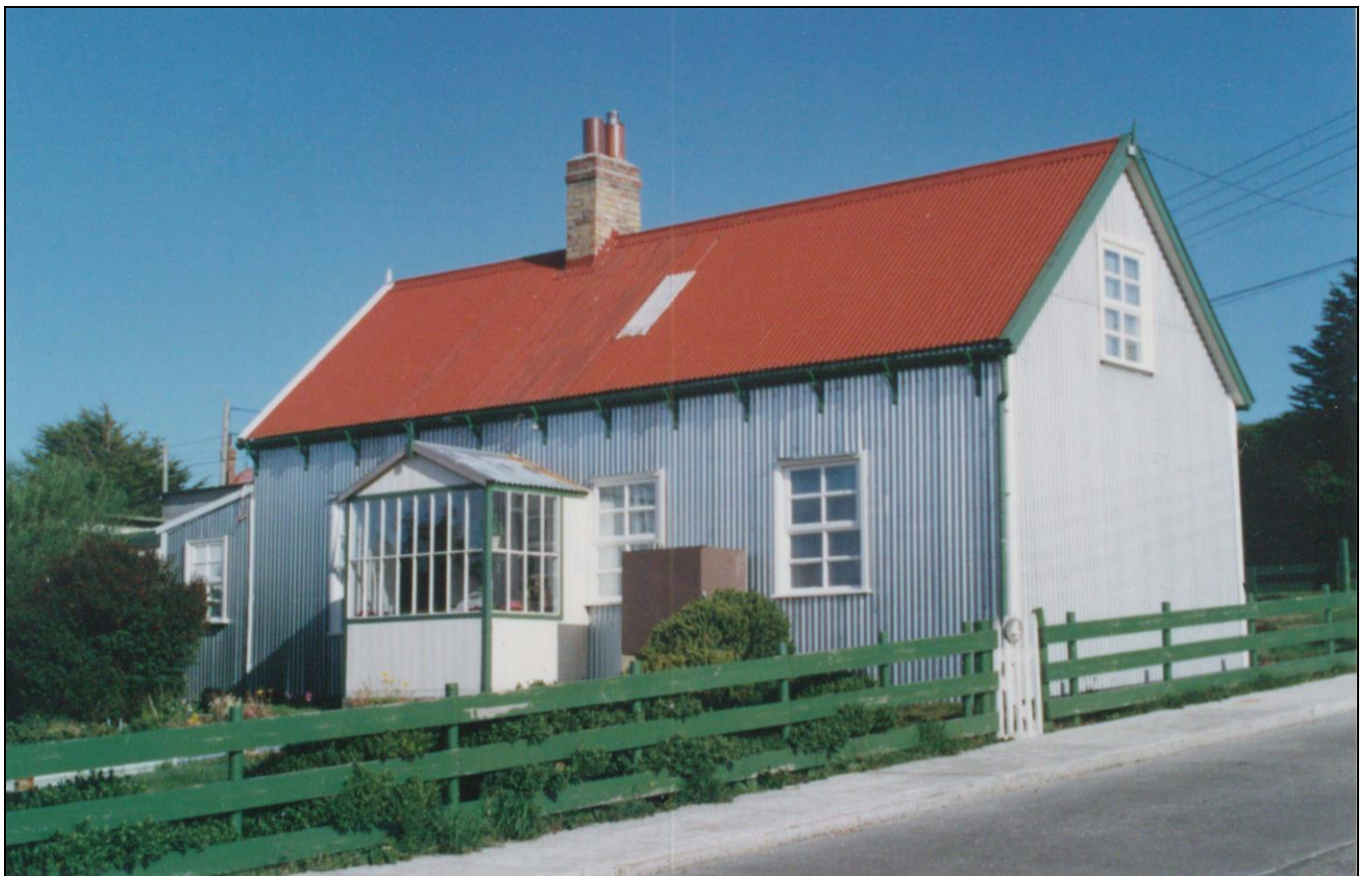
1993 - JCNA