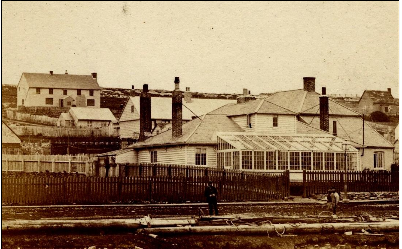
1875 - Small house middle left