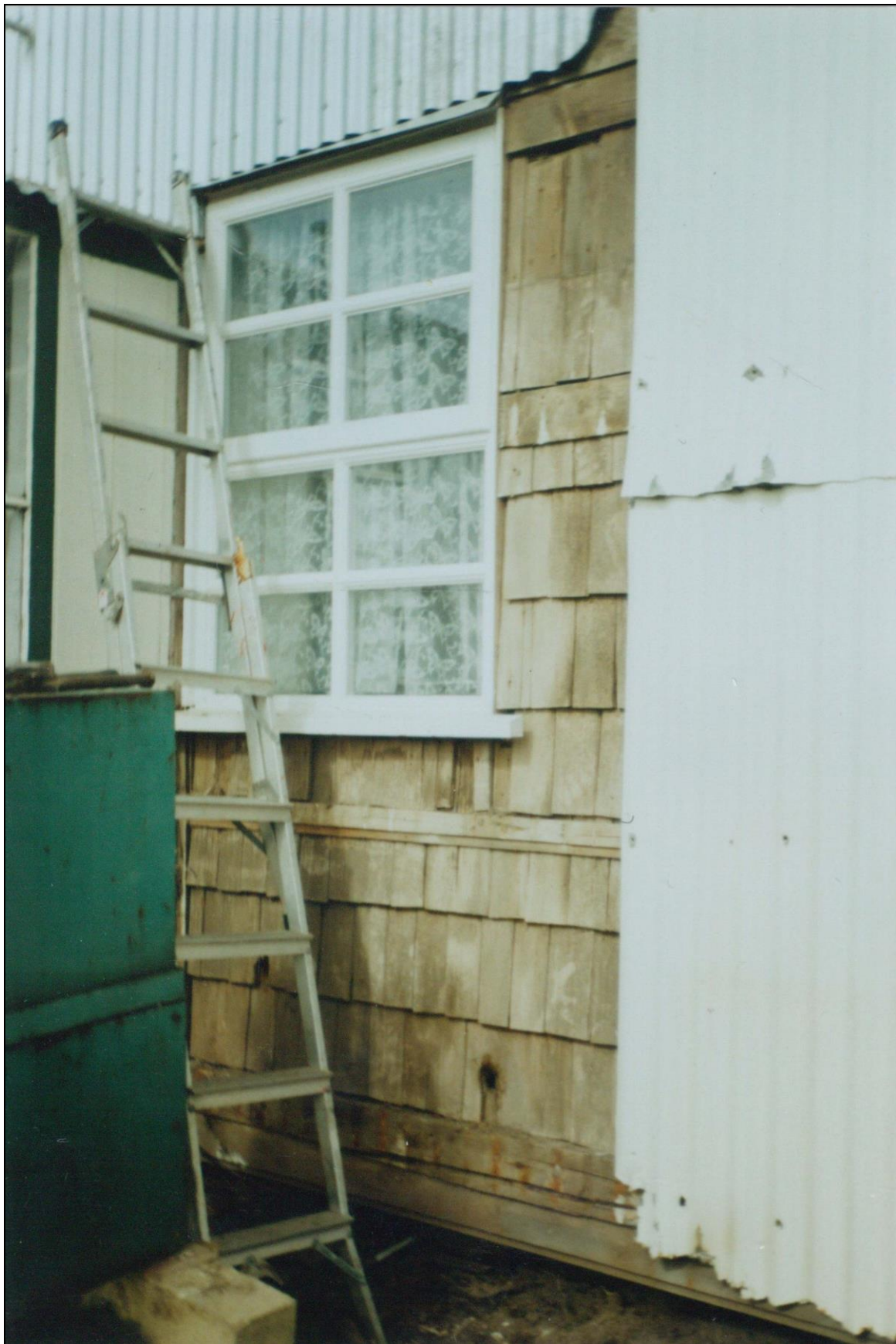
1992 - showing the original wooden shingles under the corrugated iron cladding - JCNA

On 13 March 2001, 4 Villiers Street was gazetted as being a building or structure in the Falkland Islands designated as being of architectural or historic interest.