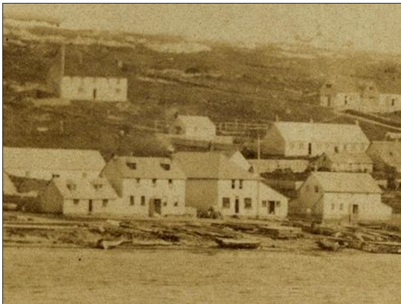
1863 - Small house middle left

At the corner of Villiers Street and the Fitzroy Road there is a wooden building, at present unoccupied, 21 feet by 15 with a fireplace and water closet outside. No fixtures." [E1; 111]