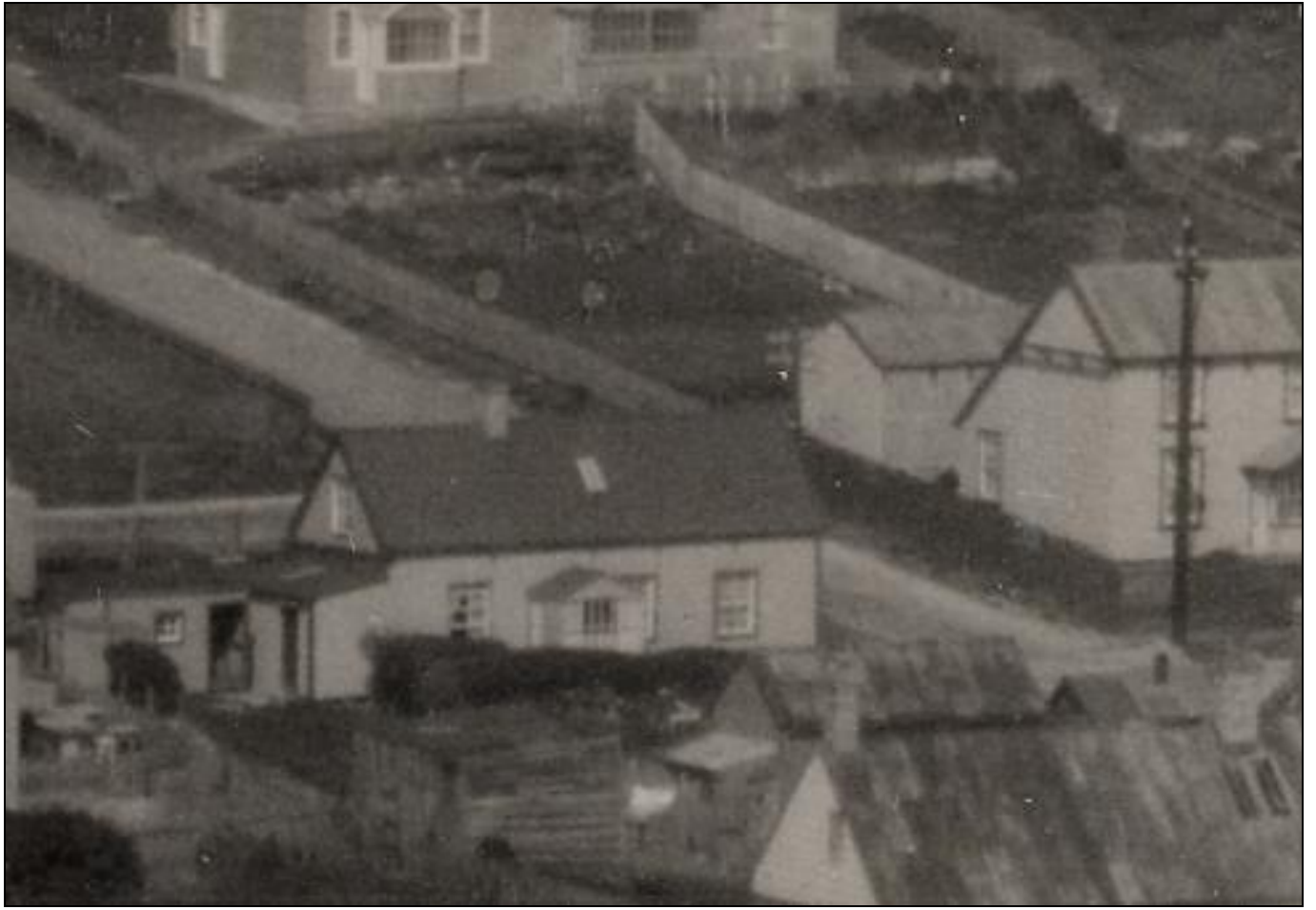
1936 - Small house front left