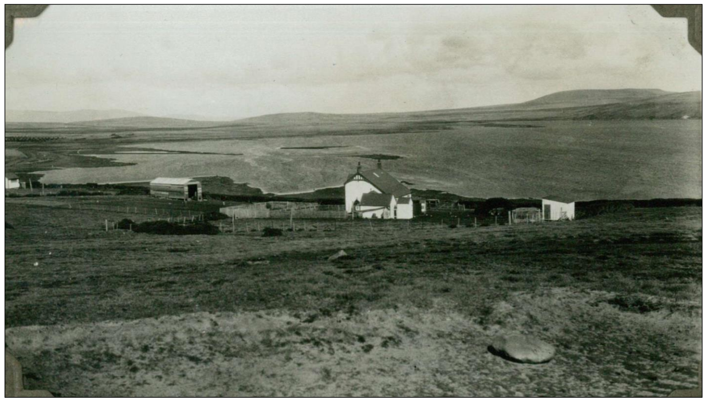
Chartres settlement on The Point

During 1903 the Chartres River Station settlement was moved further down the creek to The Point to ease shipping movements as the heavily laden schooners had problems clearing the bar. [FIC/EC/CHA/1#2]