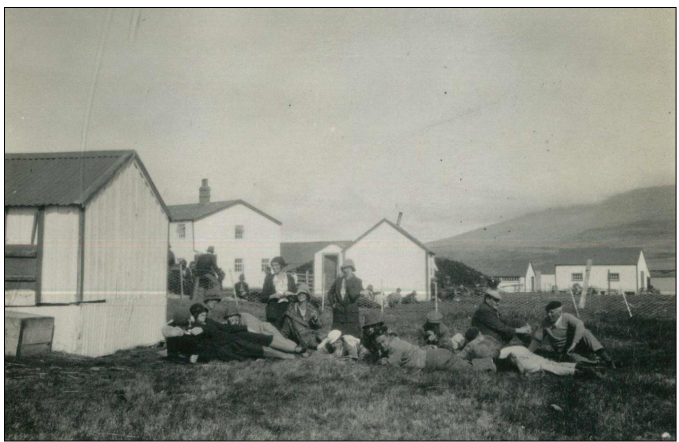
Chartres sports circa 1932/33