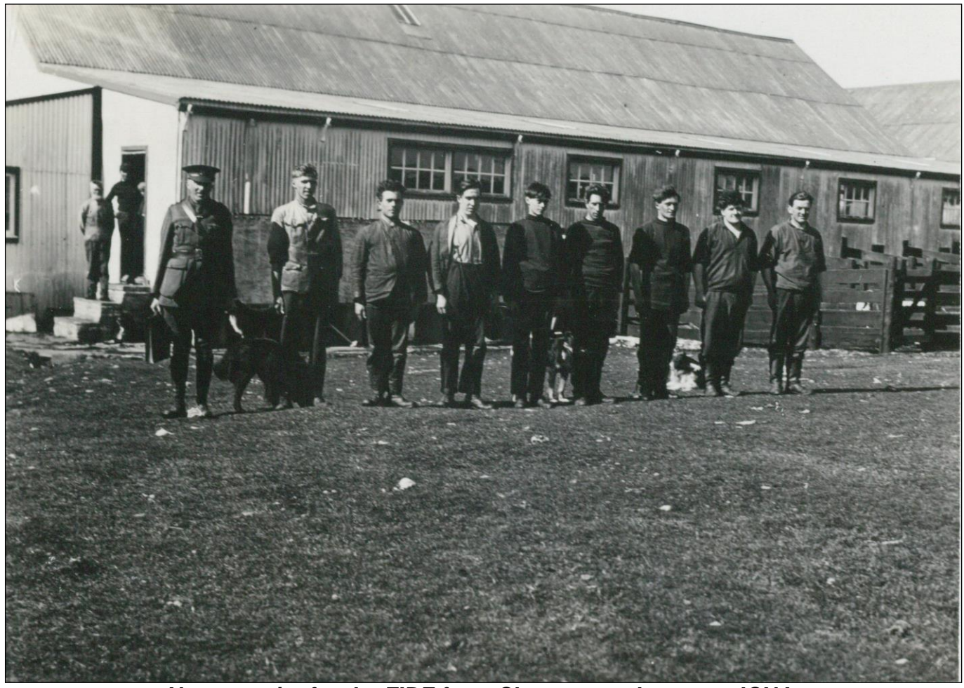
New recruits for the FIDF from Chartres settlement – JCNA

In April 1923 a bridge was suggested over the Chartres River. A drawing was submitted in April 1924 with an estimated total cost of the bridge being £550. By August 1927 this had increased to £670. The gang arrived at Little Chartres 21 March 1928 and the new bridge over the Chartres River with a span of 120 feet was completed 10 April 1928. [TRN/LAN/1#14: Annual Col Report 1928]