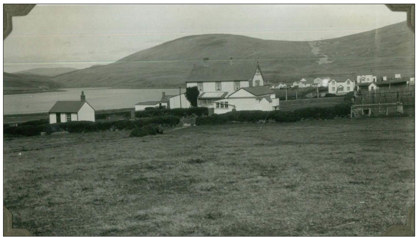
Chartres settlement

In 1946 it was recommended that an Army Nissen hut was sent to Chartres to be used as a school. This was sent out in 1947 and the foundations prepared but the erection was delayed by the non-arrival of two of the sections. [C2/45]