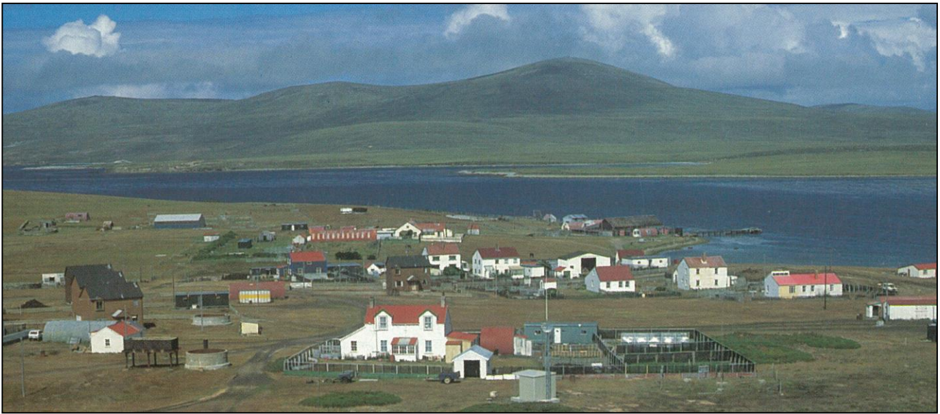
Fox Bay Village – JCNA

The farm properties of Packe Brothers on West Falkland of Fox Bay East, Dunnose Head and Packes Port Howard were offered to FIG for £500,000 25 October 1982. The farms were purchased in 1983 and run as one unit by FIG from 30 April 1983 to 30 April 1984. Dunnose Head was sub-divided into four sections: South Rincon; Centre Camp; Cattle Ground Creek; and Little Chartres. Packes Port Howard was sub-divided into two sections: Packes Port Howard South (Bold Cove) and Packes Port Howard North (Manybranch). Fox Bay East settlement was developed as a Government Village after subdivision.