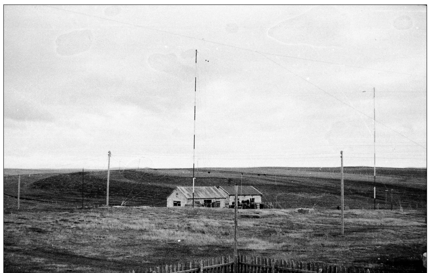
Fox Bay Wireless Station – Una Hurst Albums

The plant for a wireless telegraph station at Fox Bay was imported circa 1913 and on 11 August 1916 approval was given for the erection of the station to be proceeded with. The small Government wireless station was completed at Fox Bay in November 1918. [P6; 138: Annual Colonial Report 1918]