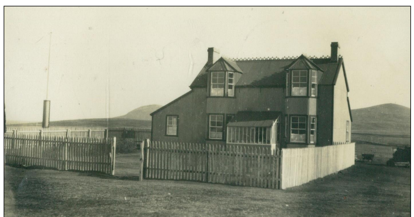
Fox Bay Magistrate's House (later the Post Office) 1930 – Hamilton Collection, JCNA

In an Executive Council meeting held 6 September 1895 the renewal of Lease 7 East Fox Bay to Messrs Packe Brothers was approved with a reservation for a house &c for a resident magistrate. [P4; 276]