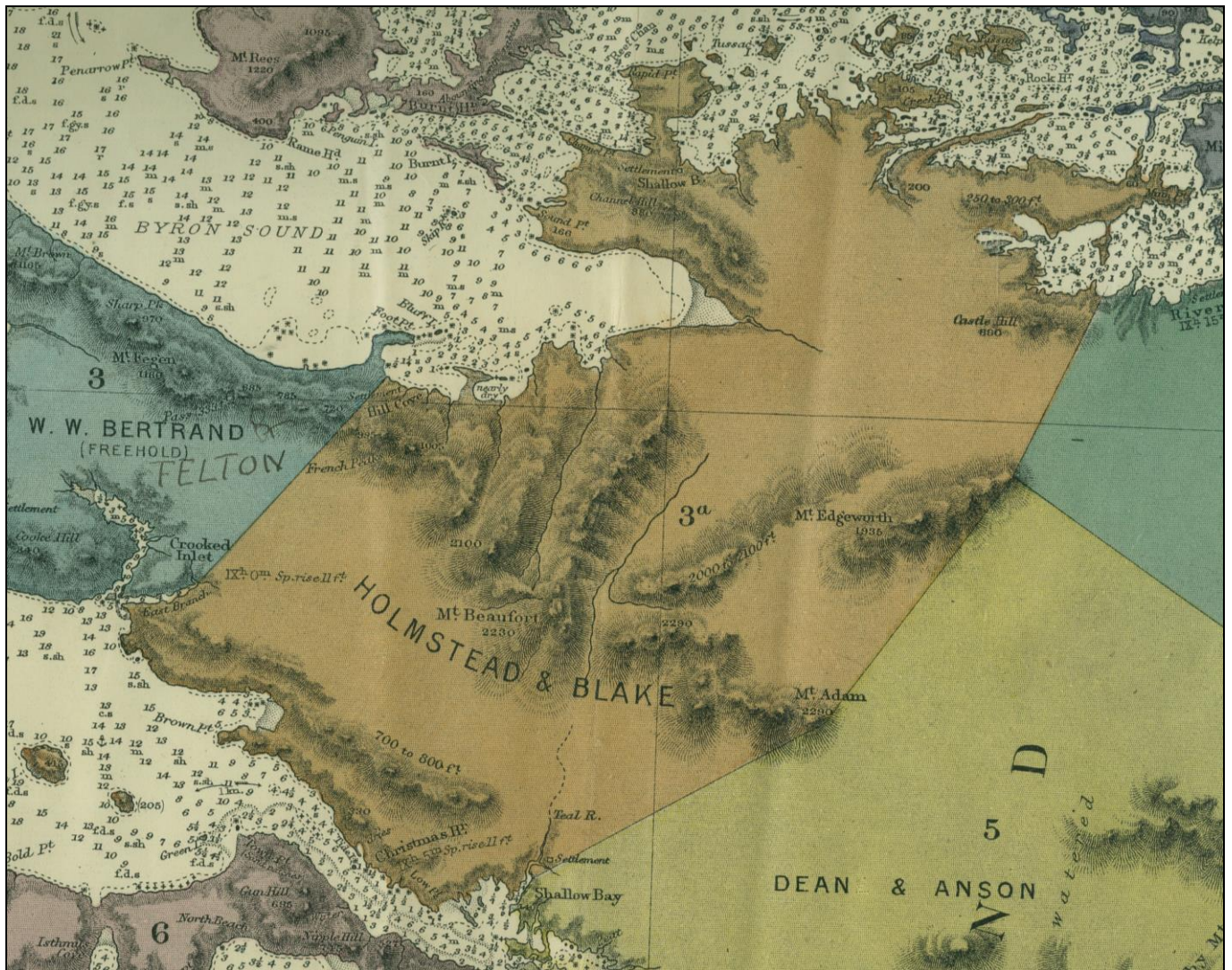
Farm boundaries 1883 – part of Hudson Chart, JCNA