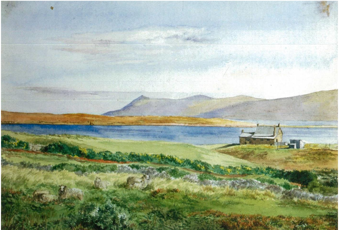
Shallow Bay 21 June 1882 by Dora Blake – Falkland Watercolours © with her family

of sheep farmers &c at Shallow Bay and New Island under the name of Holmsted and Blake with each contributing £3,000 for a capital of £6,000. [BUG-REG-1; 383]