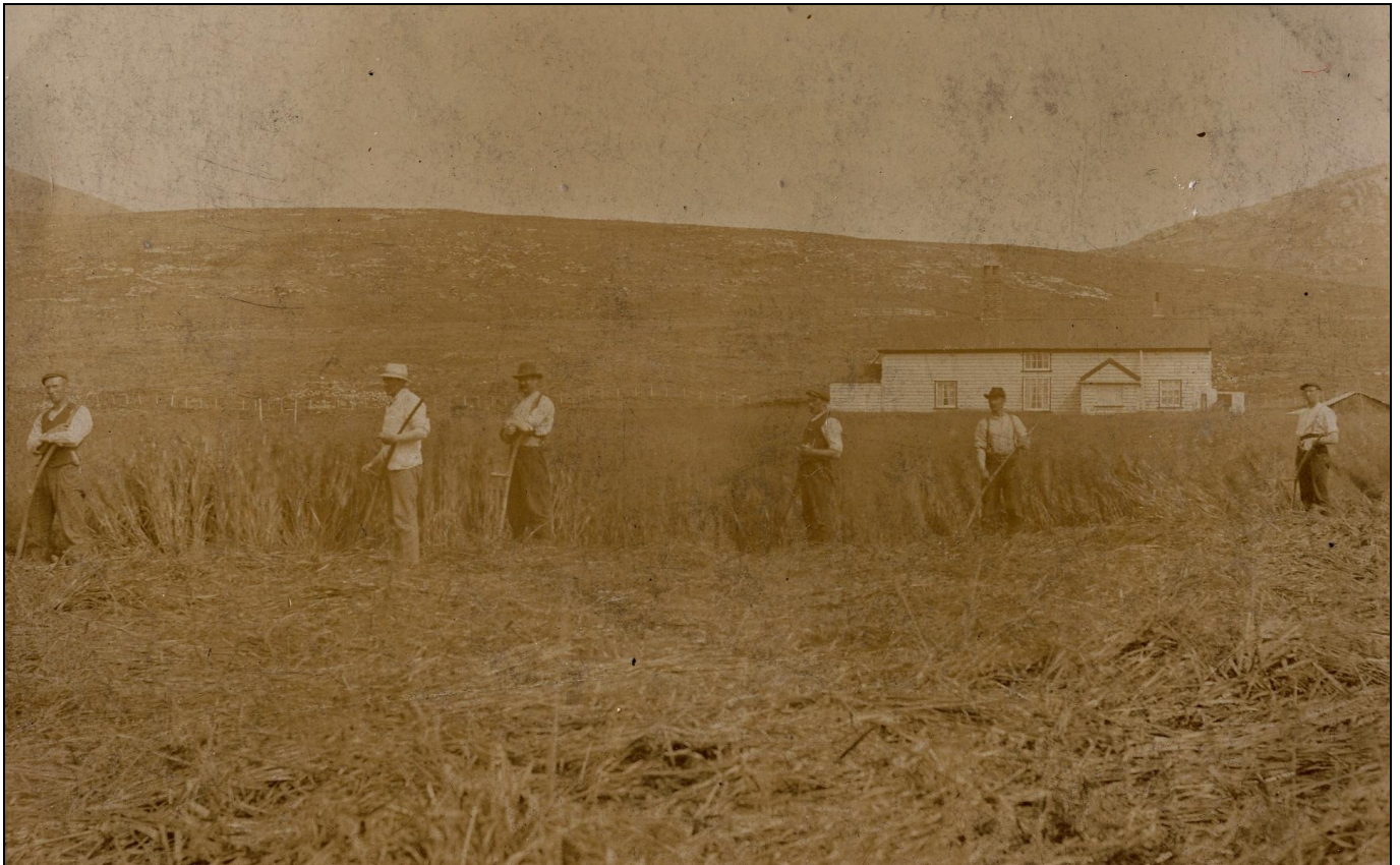
Hill Cove – cutting oats

In 1905 HOLMESTED & BLAKE applied to purchase Hill Cove Station. [P4; 72]