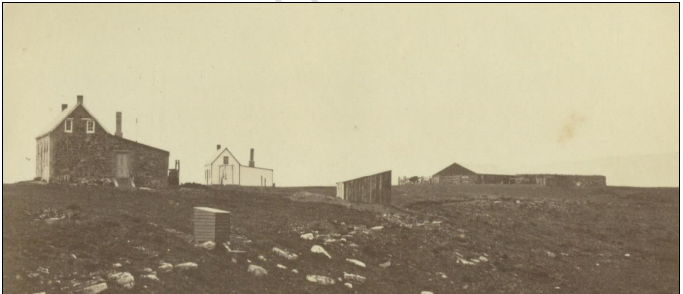
Adelaide Station circa 1878

On 5 February 1872 under the 10 th clause of the Amalgamation Ordinance of the Lease of Crown Lands of 1870 William Wickham BERTRAND transferred the portion of land bounded “on the South East by Station Nos. 6 & 7 from Teal River to River Harbour. Thence on the North and North East by the shores of River Harbour, Rock Harbour, Port Egmont and Byron Sound to Hill Cove. Thence by a line running South 39° West to the North East arm of Crooked Inlet, and containing 109,720 acres more or less, together with Tussac Island and Middle Island, and other small islands as delineated by a line of demarcation inscribed on the Chart recorded in the office of the Surveyor General” to Messrs HOLMESTED and REES who were granted a lease for 21 year from 5 February 1871 at an annual rent of £111 for the first 10 years and £184 for the remainder. [BUG-REG-2; 277]