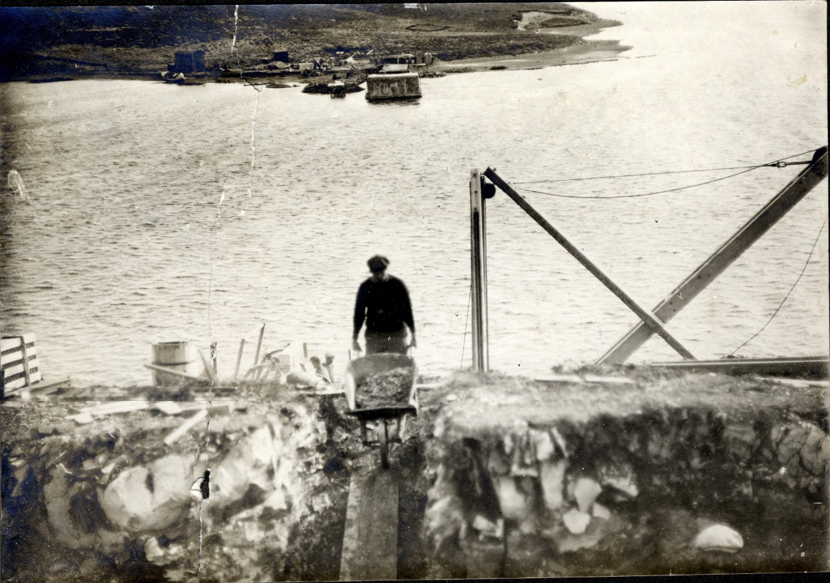
View across from Darwin side.