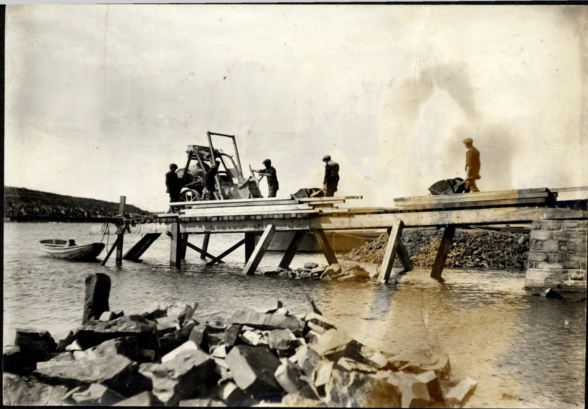
Cementing Steel Caisson on Findlay C. Side.