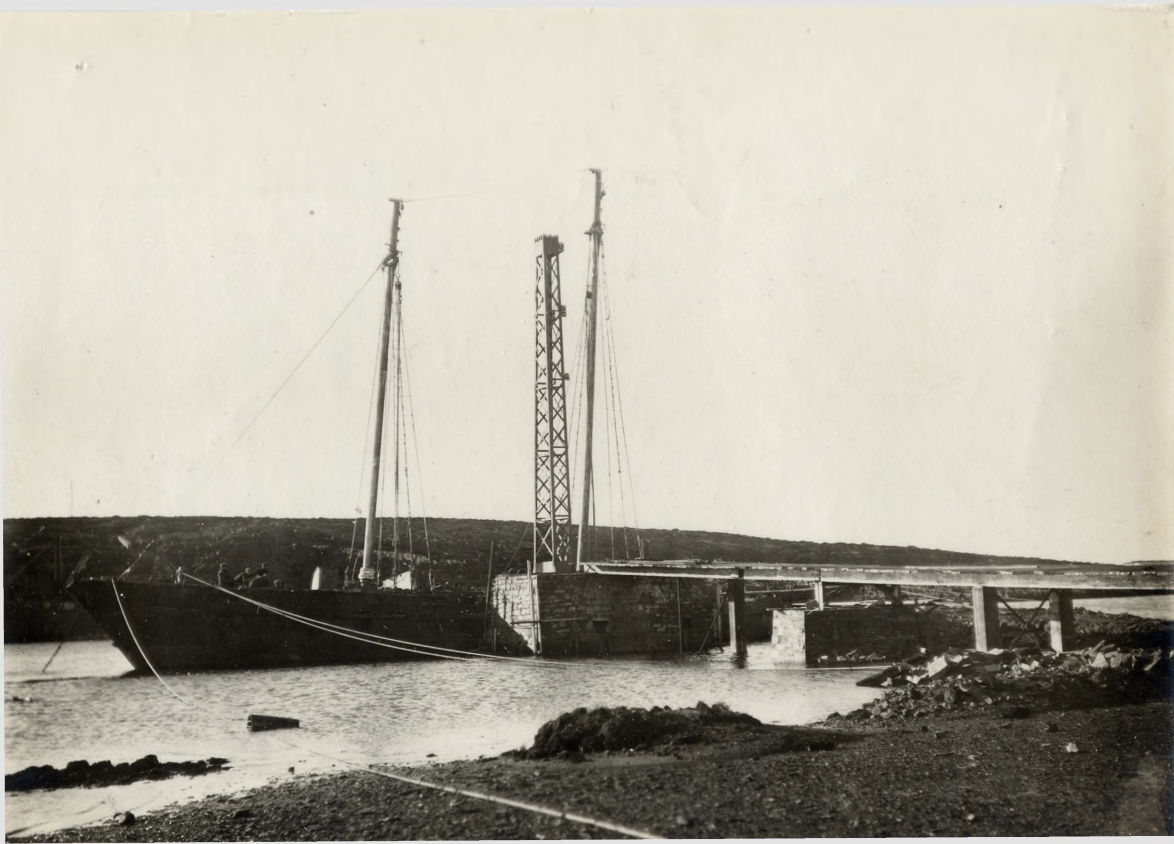
FINDLEY CREEK ABUTMENT WITH "LAFONIA" ALONGSIDE AND ONE TOWER ERECTED