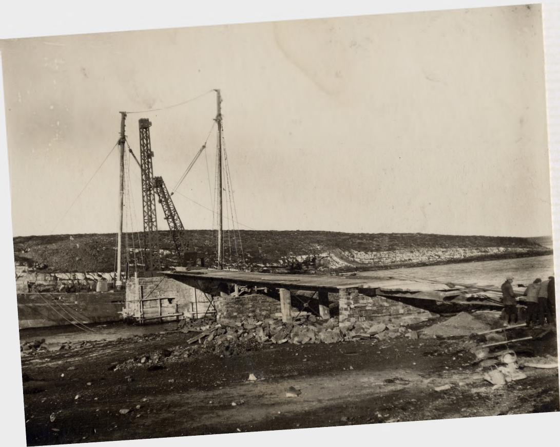
ERECTING TOWERS FROM "LAFONIA"