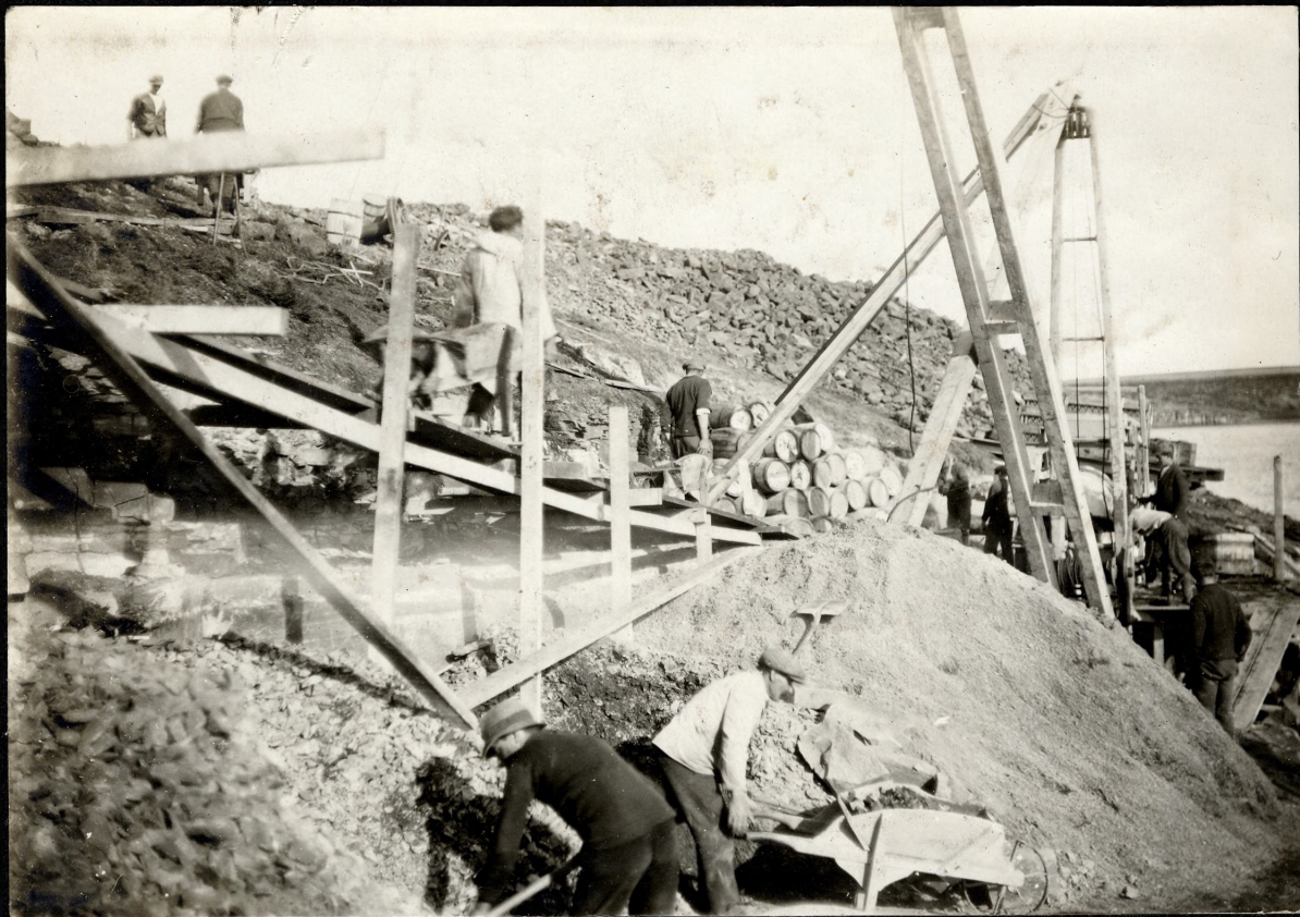
Wheeling concrete material to anchor hole.