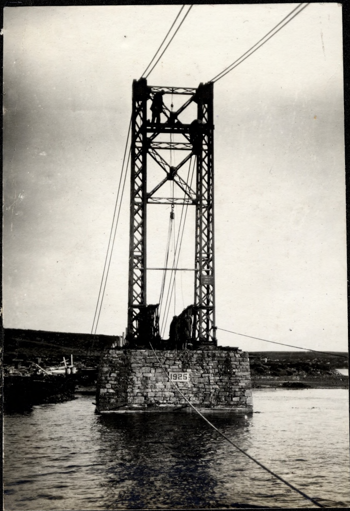
Tower and Abutment F.C. side.