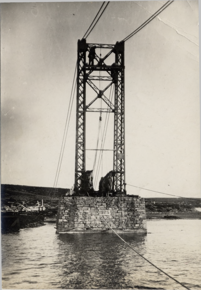
WEST SIDE TOWERS AND ABUTMENT