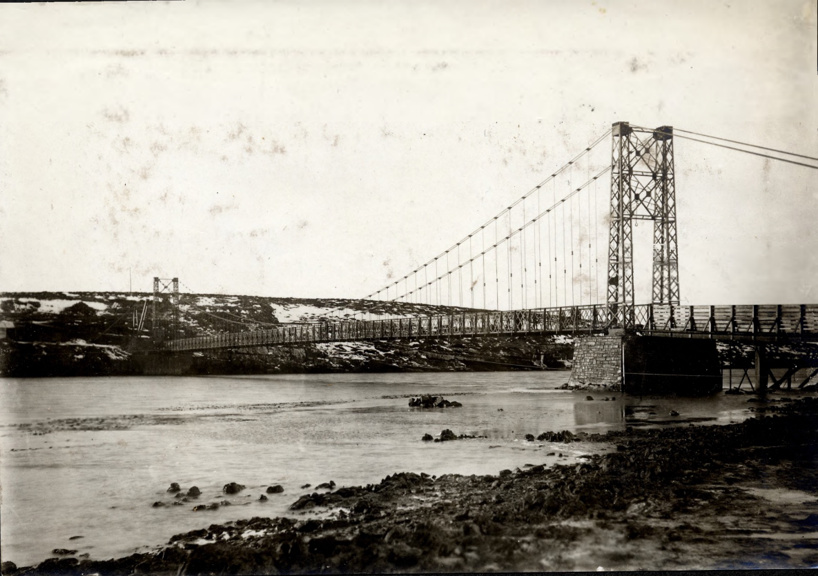
View of Bridge from F. C. side.