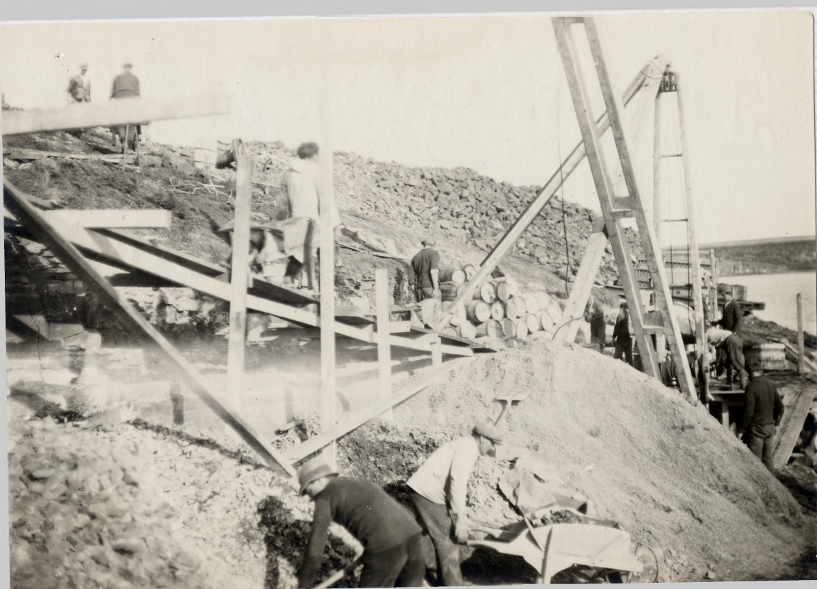
WHEELING CONCRETE TO ANCHOR HOLE ON DARWIN SIDE