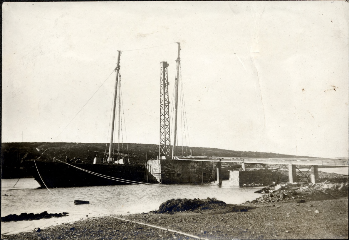
Findlay creek abutment, "Safonia" alongside.