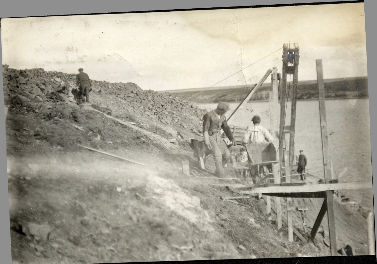
Wheeling concrete to anchor holes.