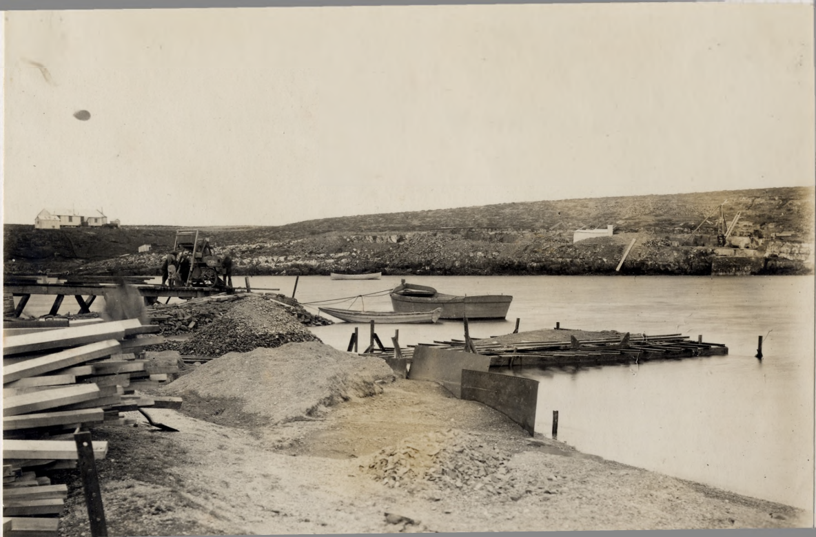
GENERAL VIEW OF WORK FROM FINDLEY CREEK SIDE