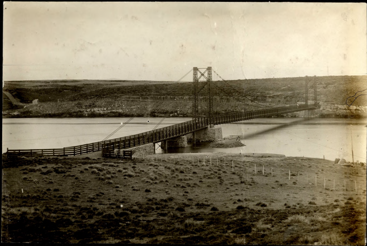
General view from Tindlay Creek side.