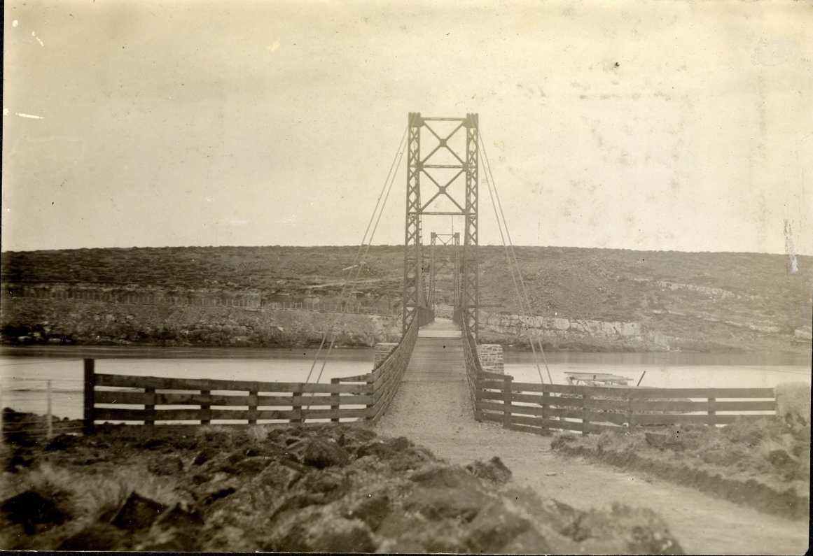
Approach from Tindley Creek side.