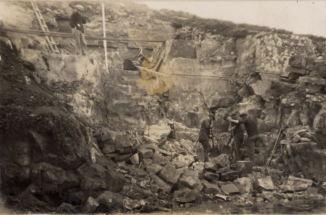
EXCAVATING FOR EAST ABUTMENT. THE LARGE SQUARE ROCKS IN FOREGROUND ARE FOR BUILDING THE MASONRY FACE OF THE CONCRETE ABUTMENT.