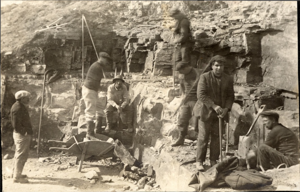
Excavating on Darwin Side.