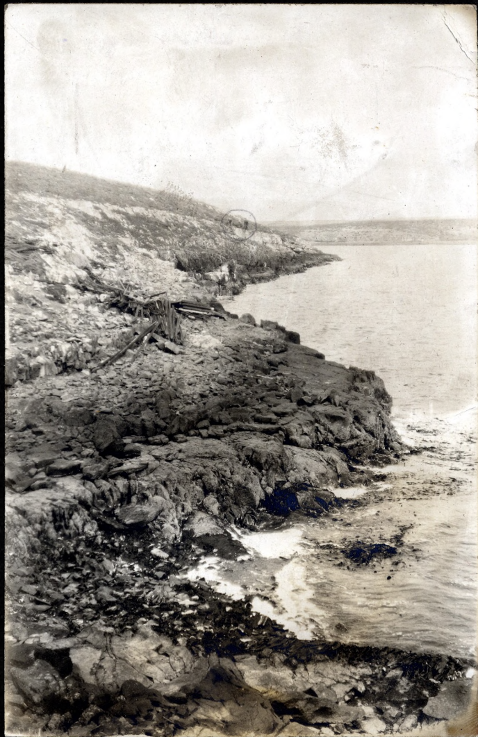
Darwin side of Creek Site of Bridge. Man in Circle.