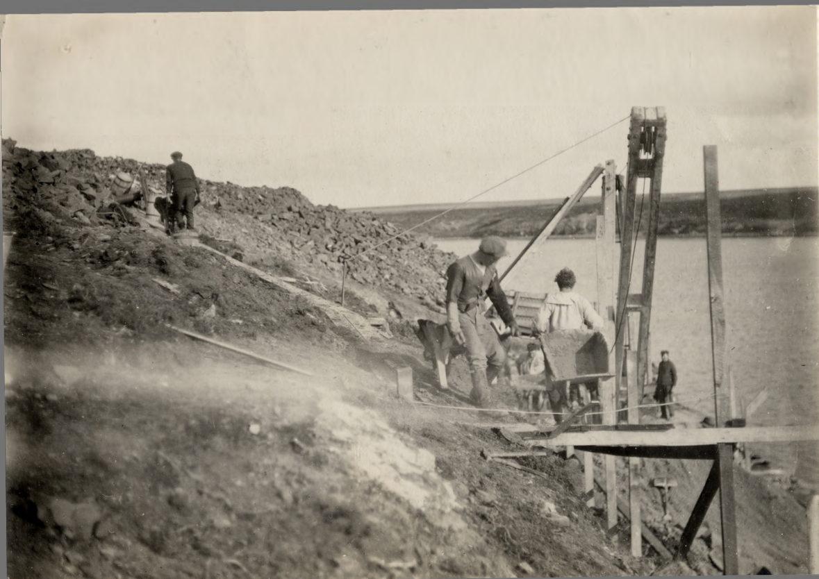
WHEELING CONCRETE TO DARWIN SIDE ANCHOR HOLE