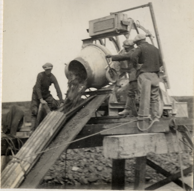
CONCRETE MIXER IN ACTION ON WEST ABUTMENT FILLING IN STEEL CAISSON.