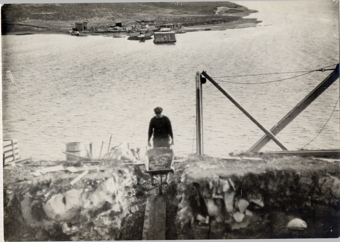
VIEW ACROSS CREEK FROM DARWIN SIDE ANCHOR HOLE