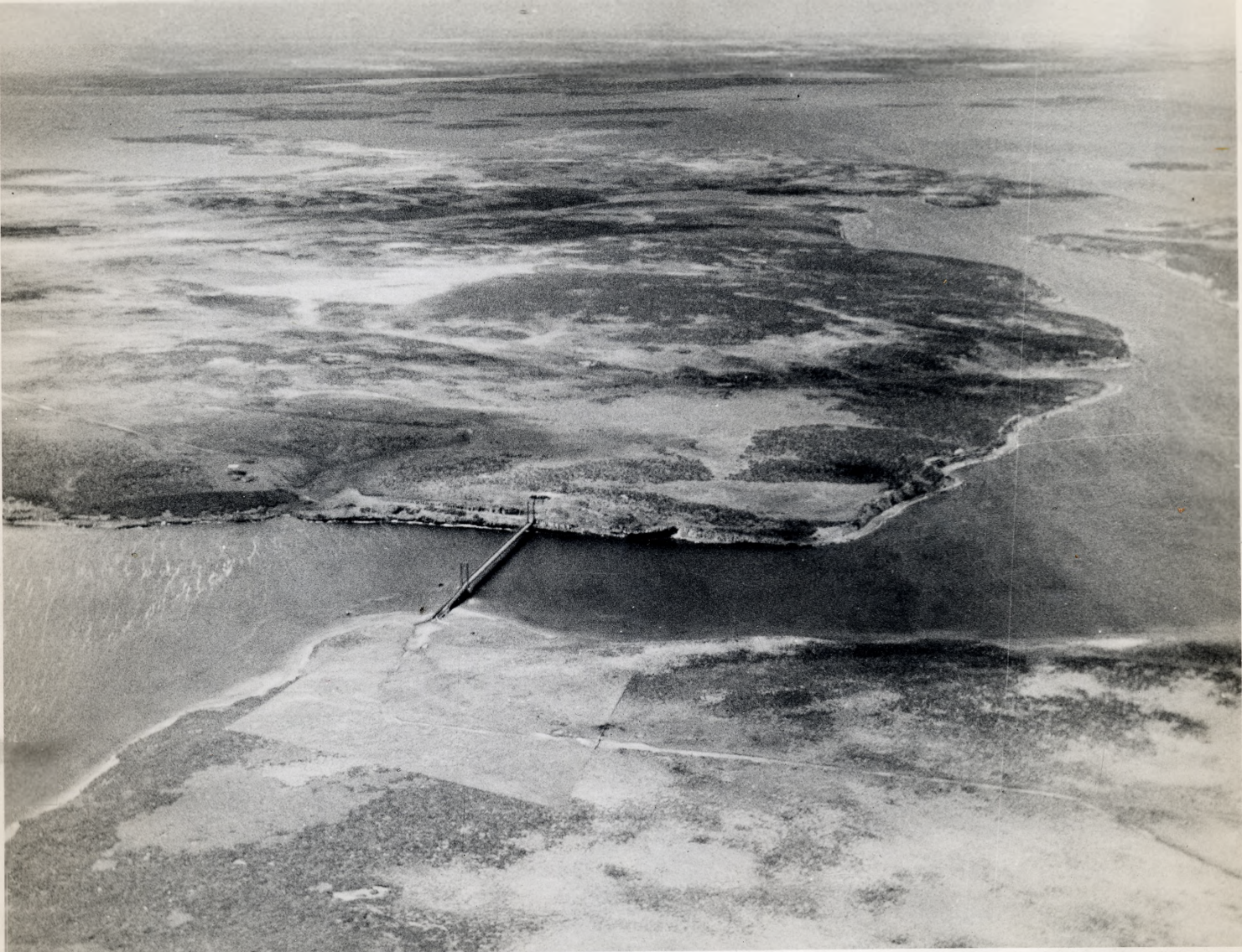
BODIE BRIDGE FROM SOUTH.