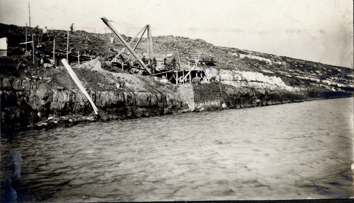
Cementing anchor hole P. side.