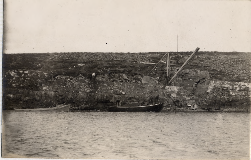
SITE AT DARWIN SIDE OF CREEK