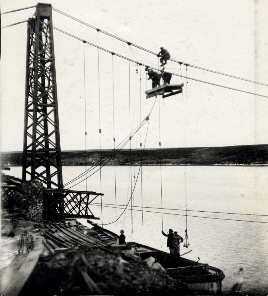
Fixing Suspender Rods.