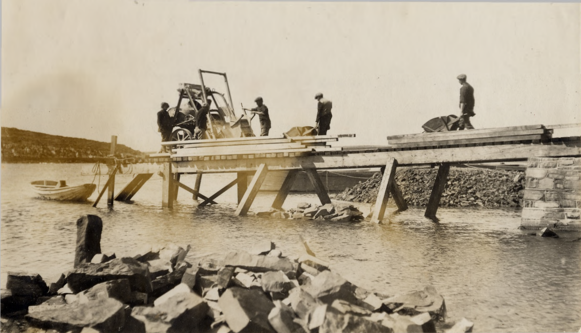
CONCRETING STEEL CAISSON FROM THE END OF TEMPORARY JETTY, SHOWING MASONRY BUTTRESS IN RIGHT HAND SIDE FOR SUPPORTING ROADWAY.