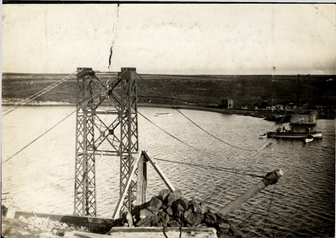
Rafting Suspension Wires across Creek.