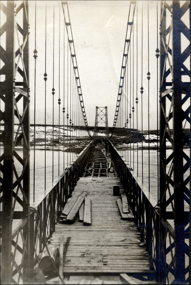
View across Bridge.