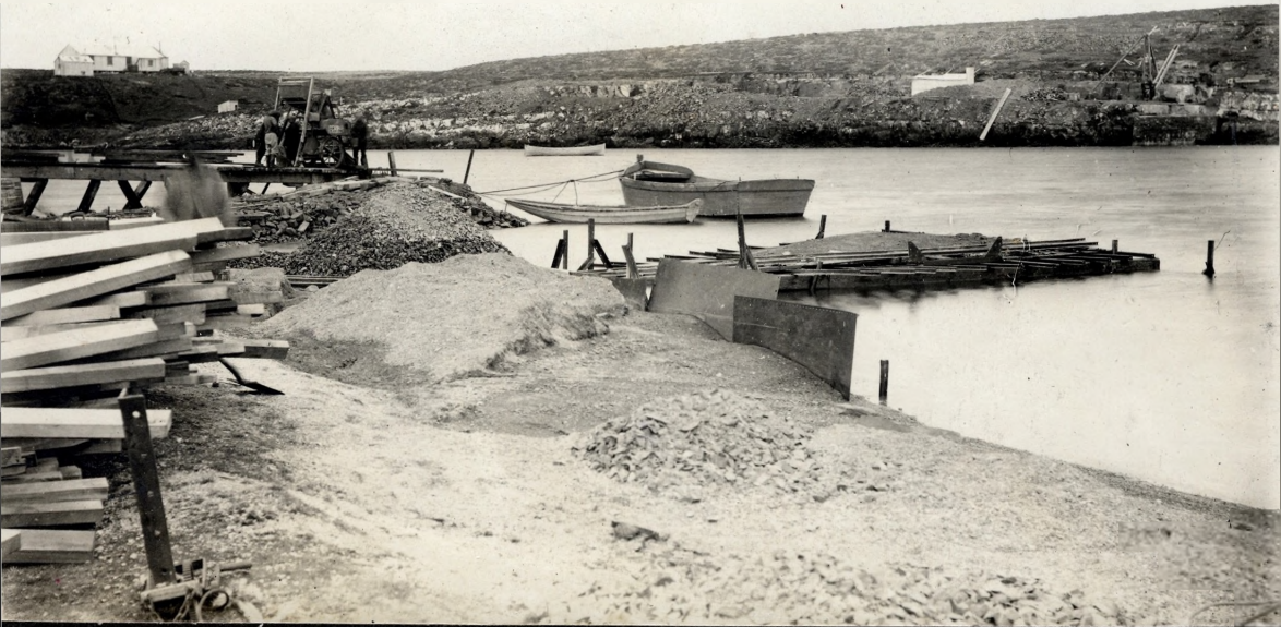
View from Hindlay Creek Side.