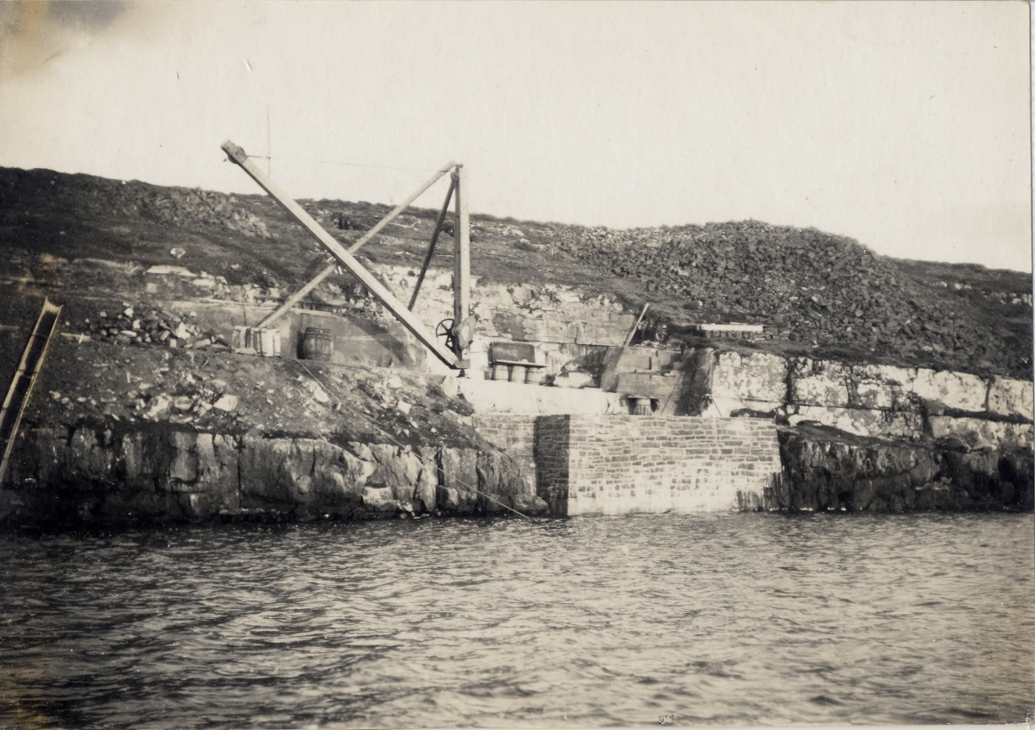
DARWIN SIDE ABUTMENT