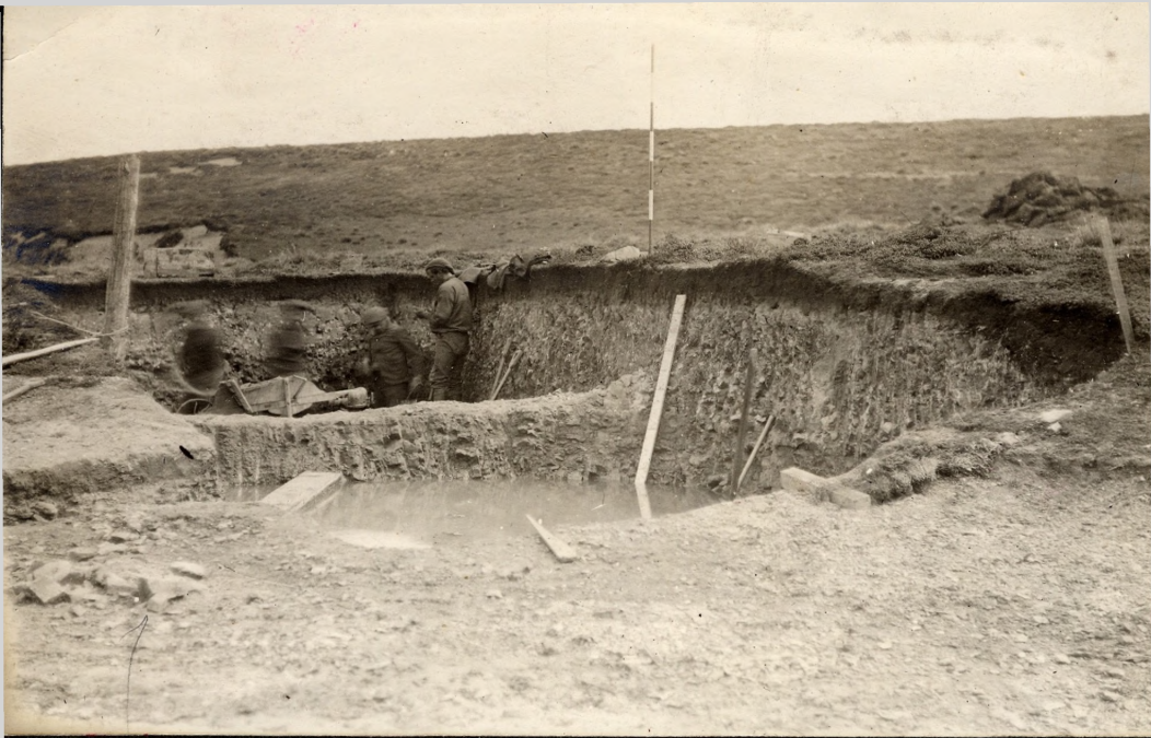
Anchor hole Hindlay Creek Side.