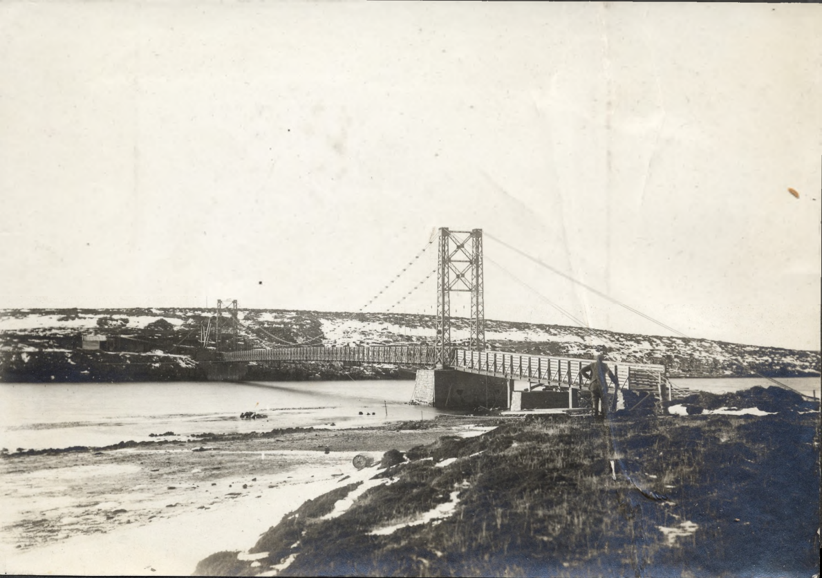
View from F. C. side.