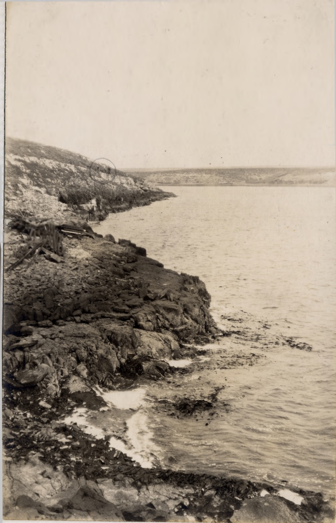
EAST SIDE OF BODIE CREEK. LEFT OF BRIDGE IS WHERE MEN ARE WORKING (IN CIRCLE)