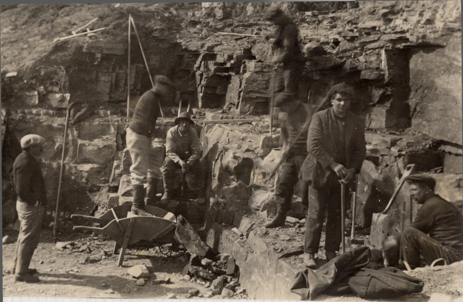
EXCAVATING ROCK ON EAST CLIFF BODIE CREEK