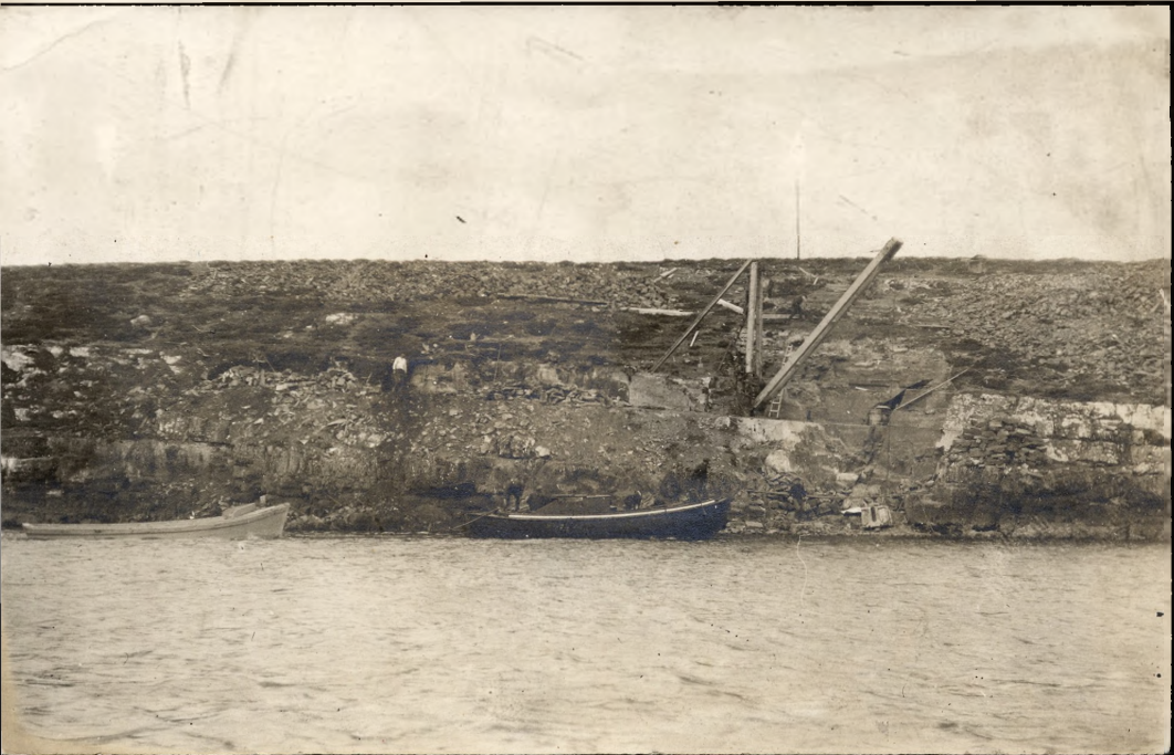
Site on Darwin Side.