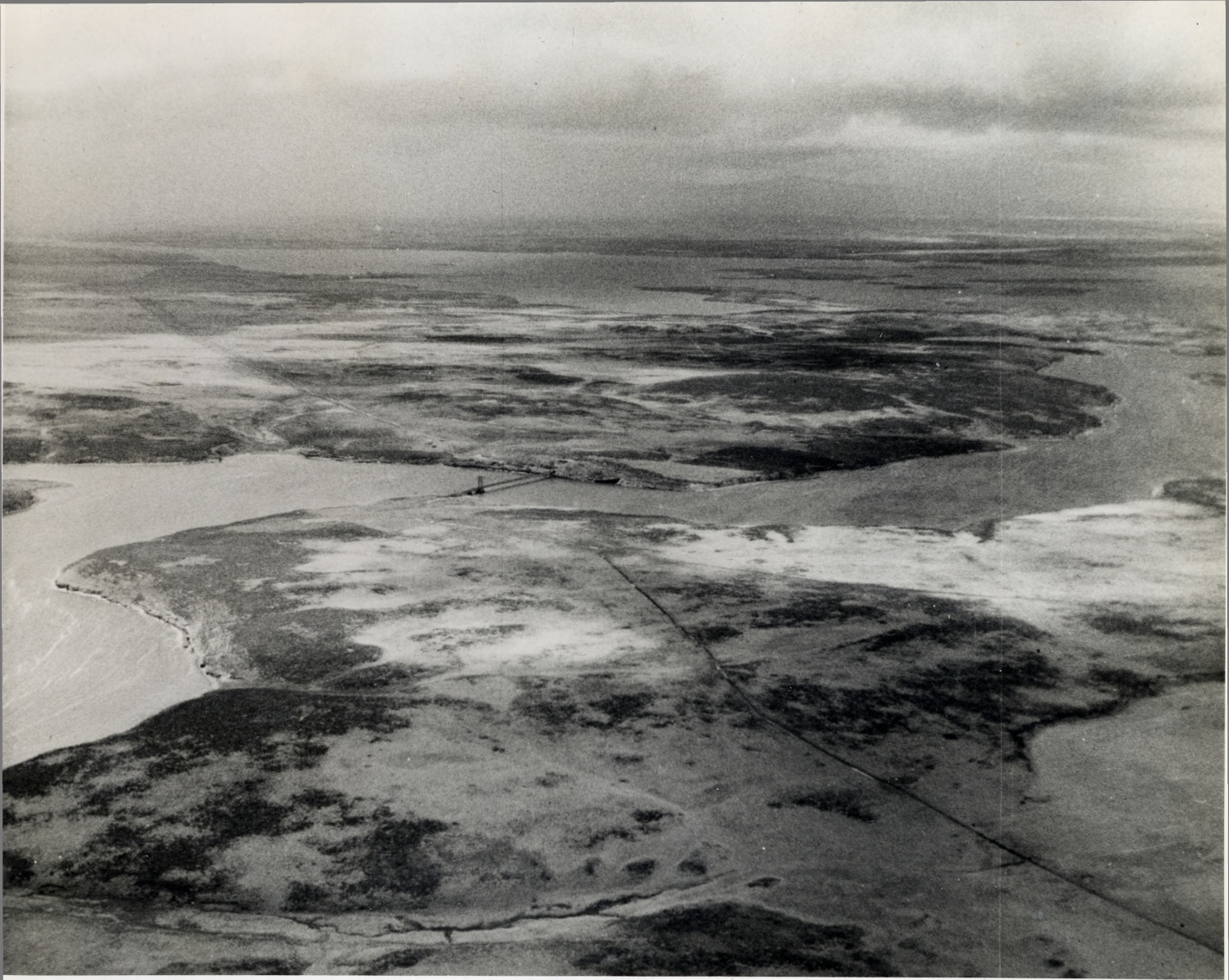
BODIE BRIDGE FROM SOUTH.