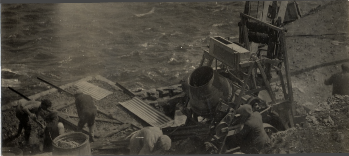
CONCRETE MIXER IN ACTION ON DARWIN SIDE ABUTMENT.