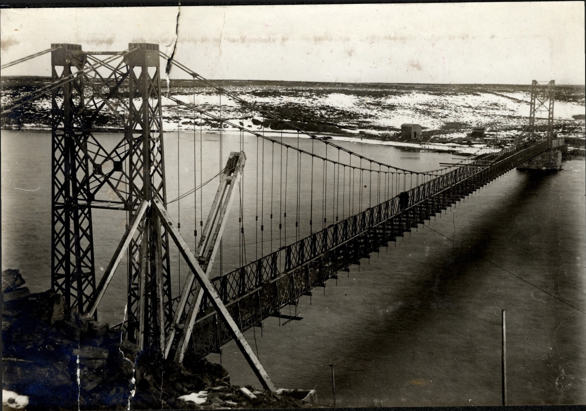
View of Bridge from Darwin side.