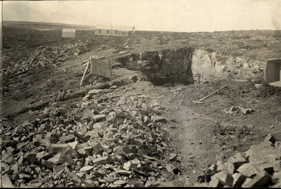
Excavations for Anchor Hole D. side.