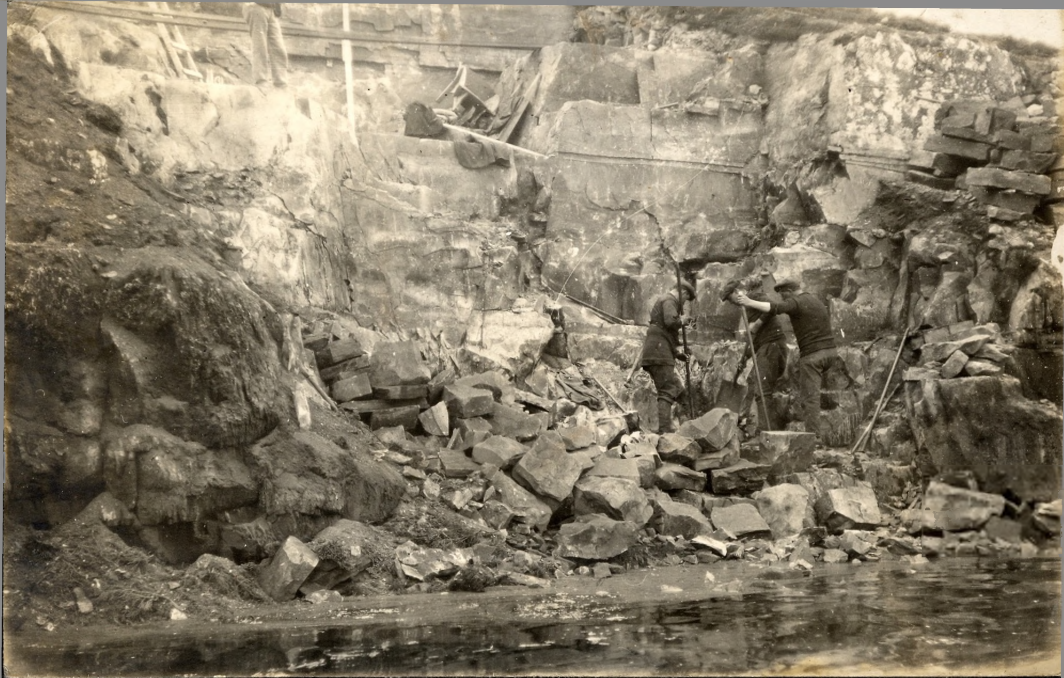
Excavating on Darwin Side.