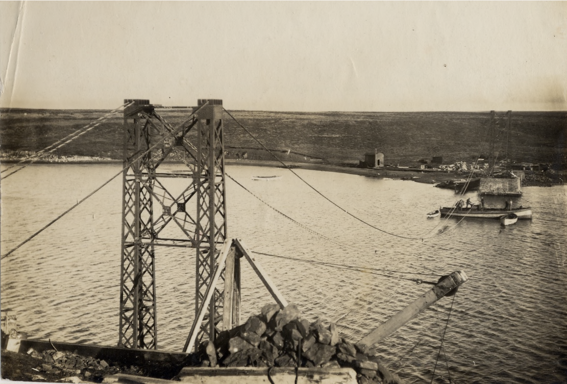
PUTTING SUSPENSION WIRES OVER CREEK