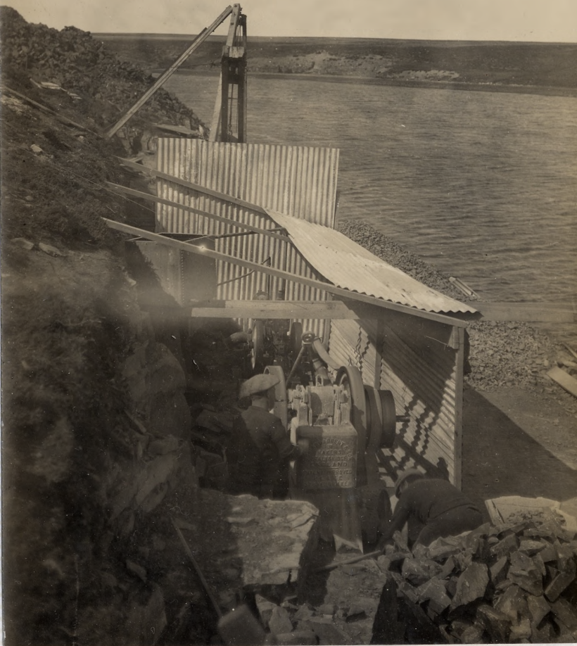
STONE CRUSHER IN ACTION ON ROAD IN CLIFF SIDE