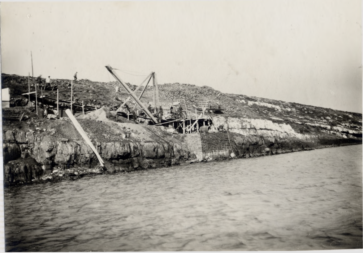
CONCRETING DARWIN SIDE ANCHOR HOLE