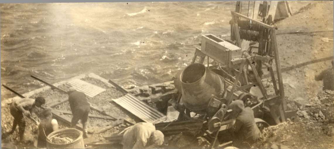
Concrete Mixer on Darwin Side.