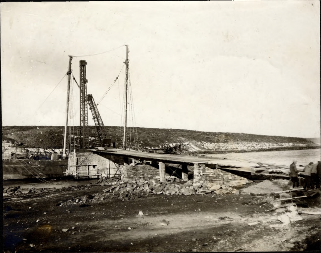
Erecting towers from schooner "Lafonia".