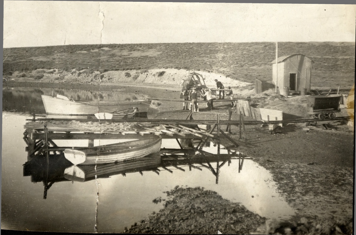
Shipping Concrete Mixer across Creek.