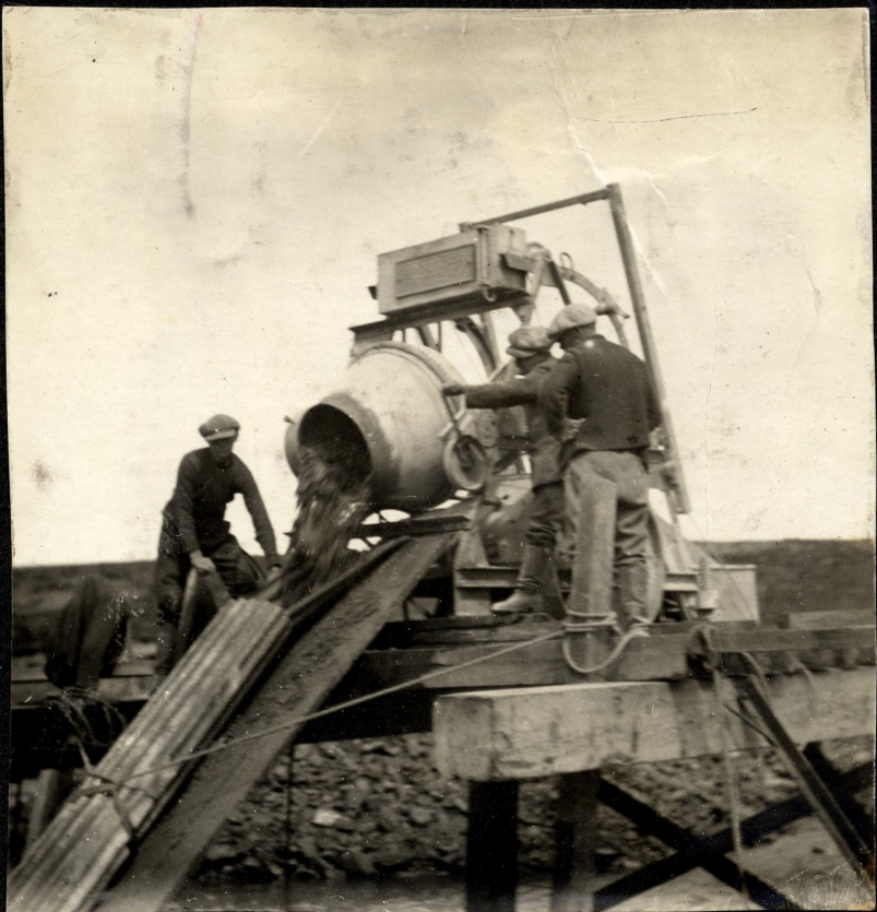
Concrete Mixer. Filling Steel Chiss on Findlay C. Side.