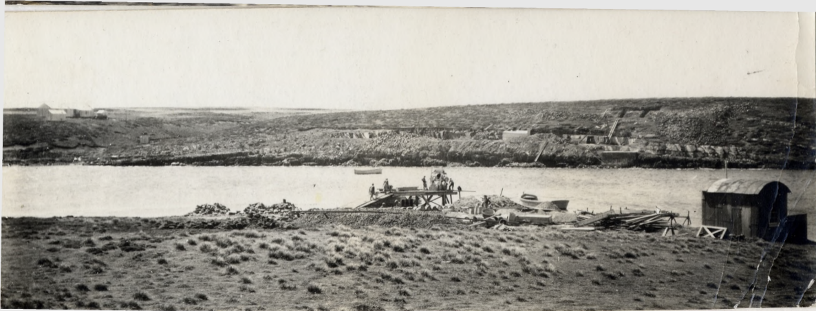
GENERAL VIEW FROM FINDLEY CREEK SIDE