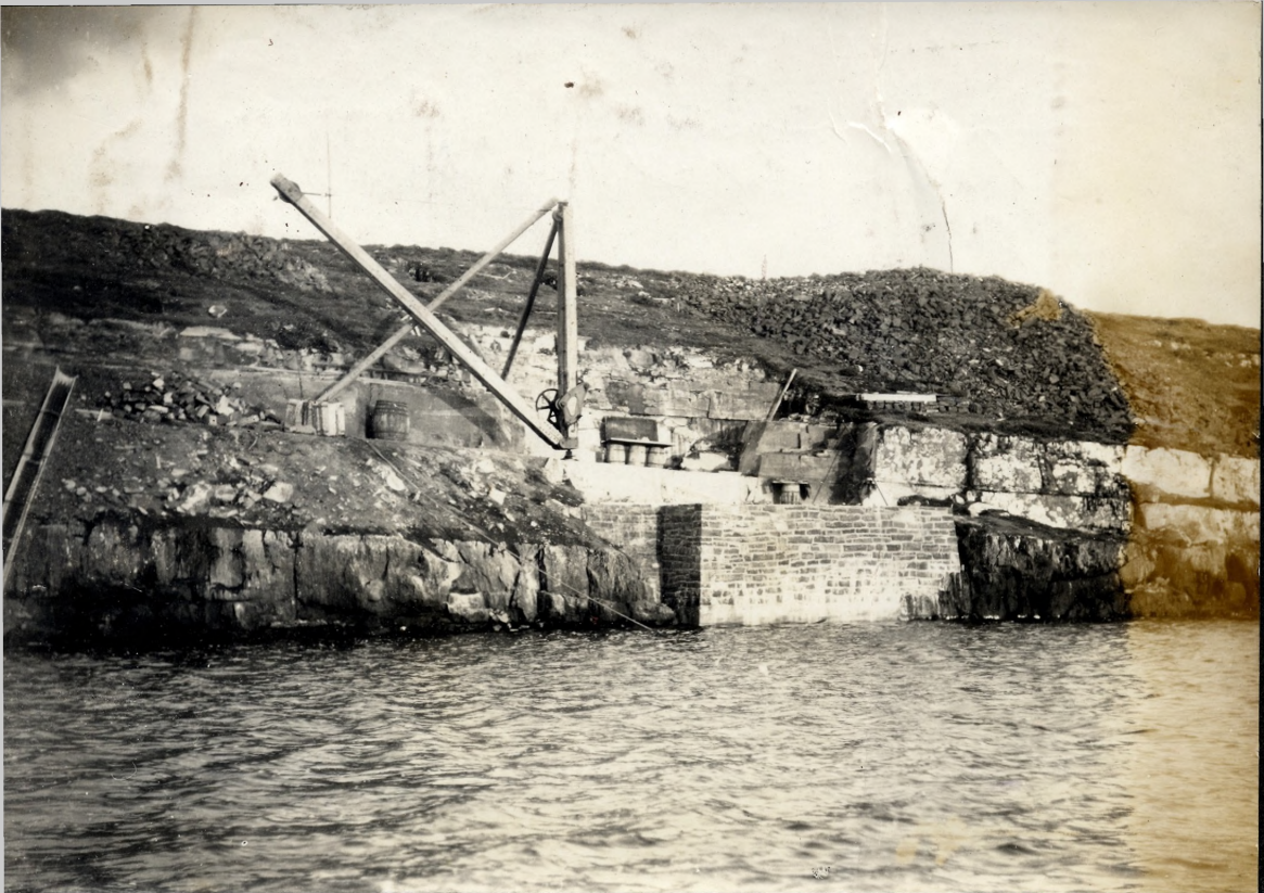
Darwin Side Abutment.