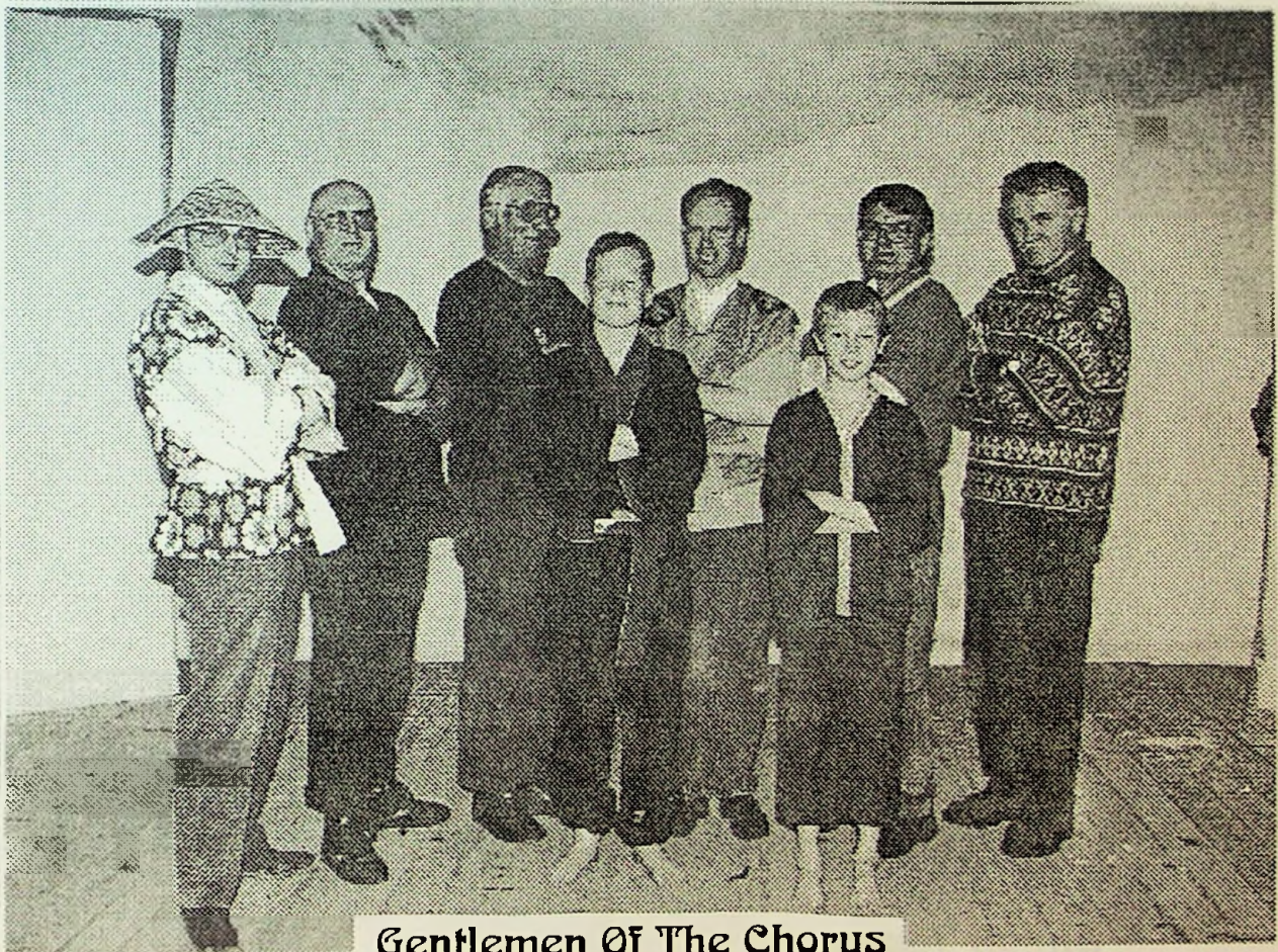
Gentlemen Of The Chorus