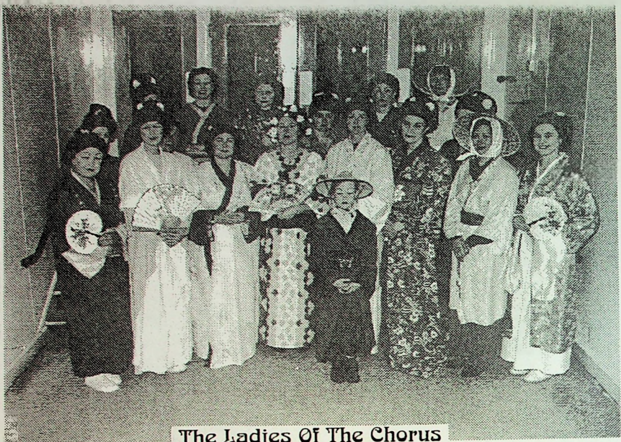
The Ladies Of The Chorus