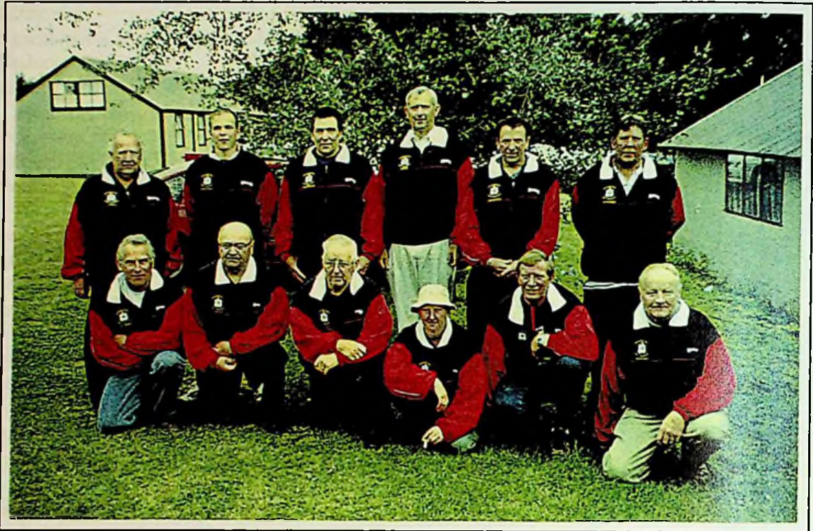
Above - The Falkland Islands Rifle Club Bisley 2000 Team.