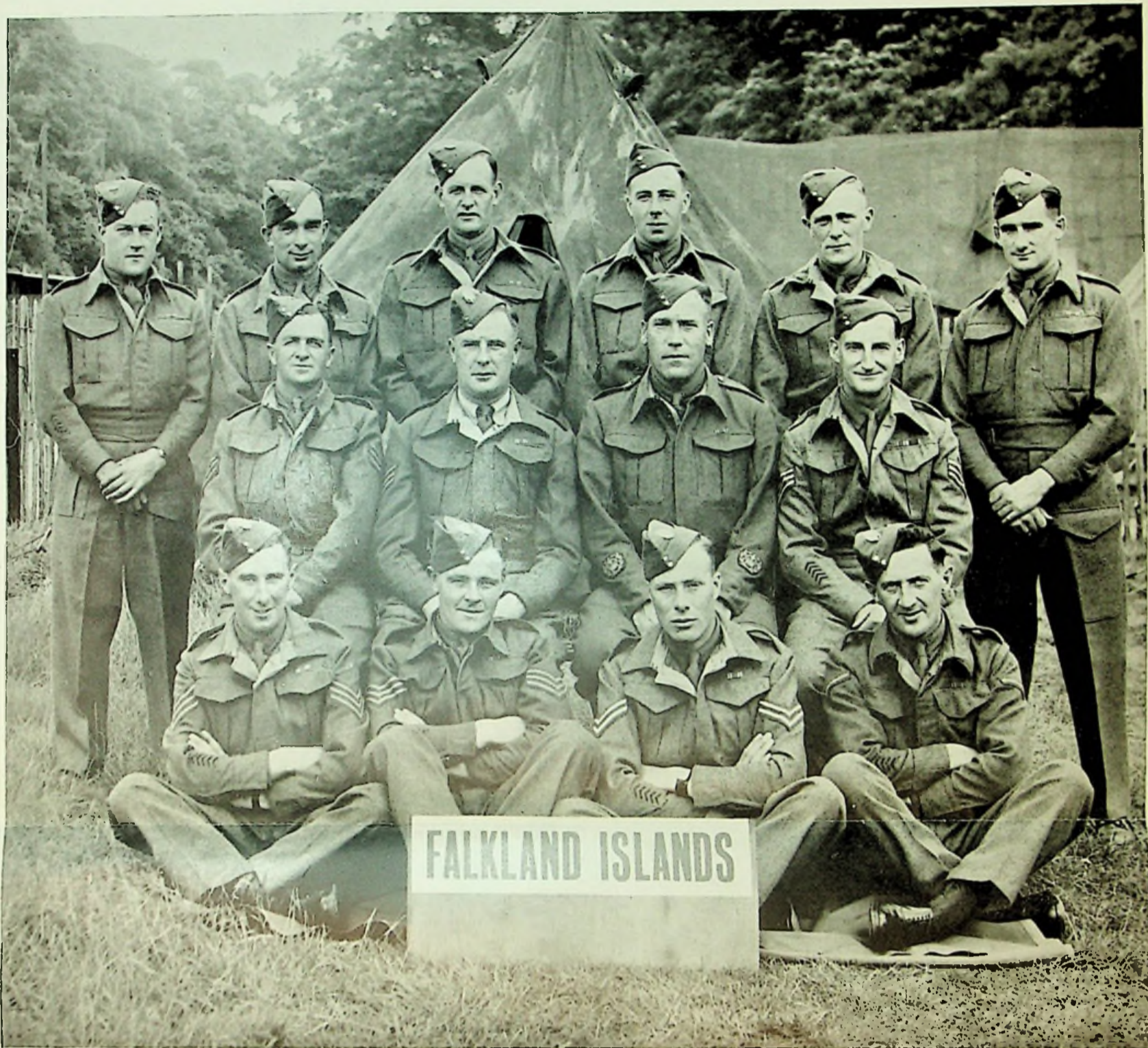
The Victory Parade contingent from the Falkland Islands photographed in camp.