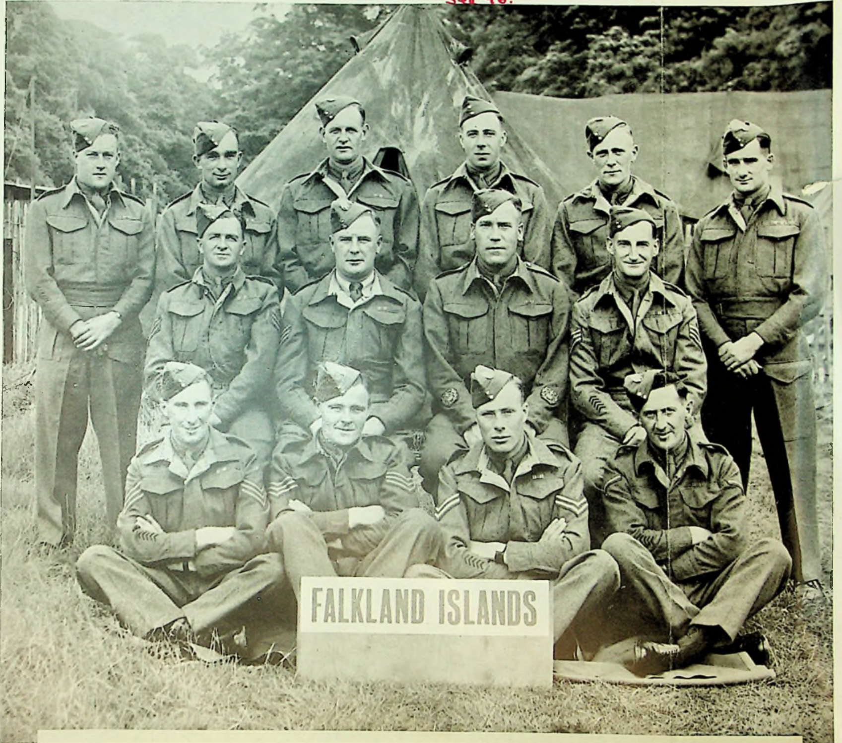
The Victory Parade contingent from the Falkland Islands photographed in camp.