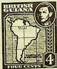
53. South America.