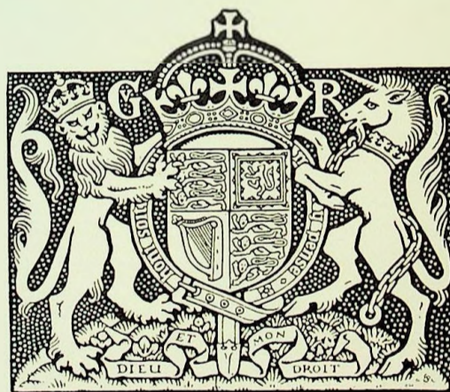
No. 5. (2¾ ins.)