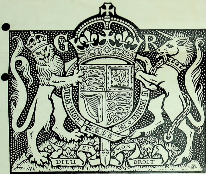
No. 2 (4½ ins.)

3386 Wt. 15086-37 375 10/24 S.E.R. Ltd. Gp. 56