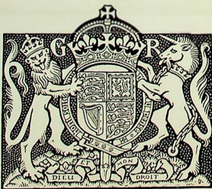
No. 7. (2¼ ins.)