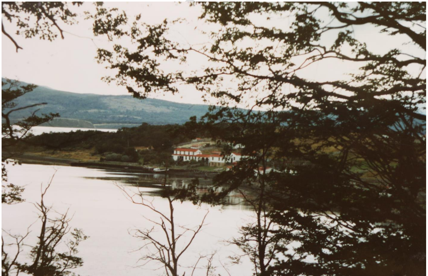
Estancia Harberton

Thomas' biography is available in the Dictionary of Falklands Biography: https://www.falklandsbiographies.org/biographies/bridges_thomas