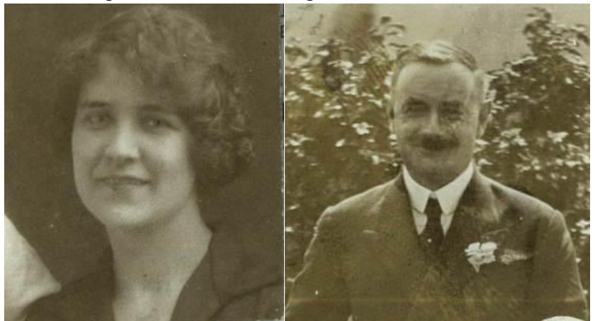
Mabel age 31 & Montague age 47