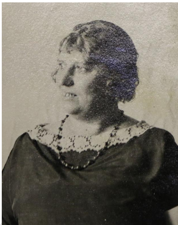
Rose in 1927