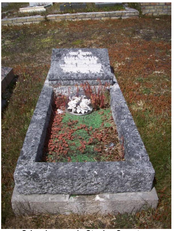
Orissa's grave in Stanley Cemetery

Orissa, age 37, died 1 February 1907 in Stanley from tuberculosis and was buried 3 February 1907 in Grave I 602. Charles, age 77 and a mariner, died 13 September 1934 in Stanley and was buried Sunday 16 September 1934 in Grave K1073. [Obituary Penguin 17 Sep 1934]