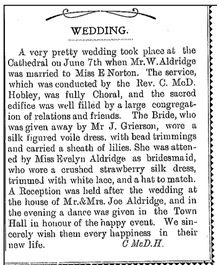
Falkland Islands Magazine August 1917