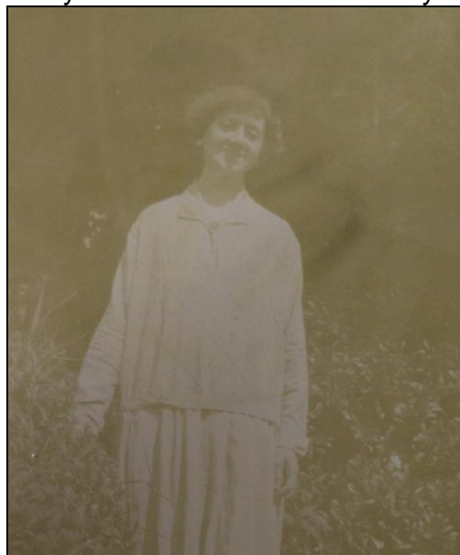
Catherine in 1929