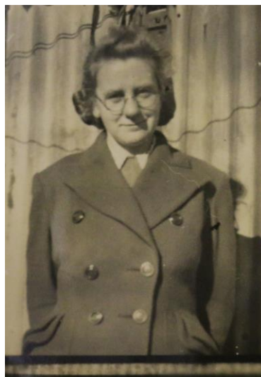
Roma in 1950