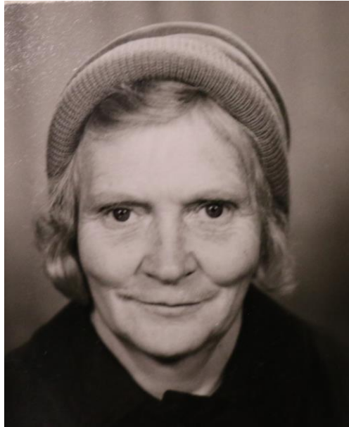
Iola in 1969