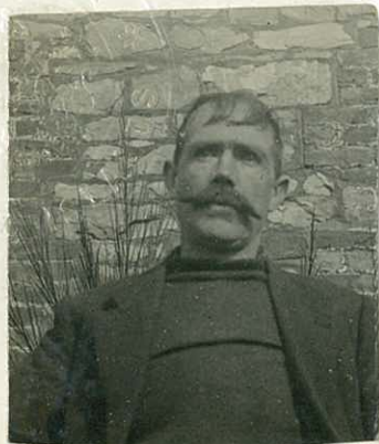
PHOTOGRAPH OF BEARER.