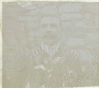
PHOTOGRAPH OF BEARER.