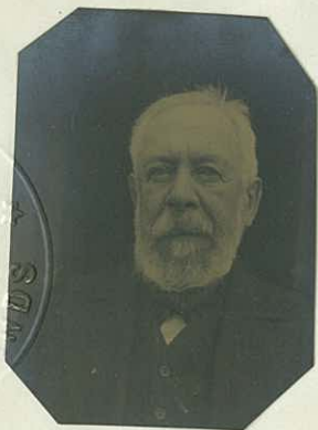
PHOTOGRAPH OF BEARER.