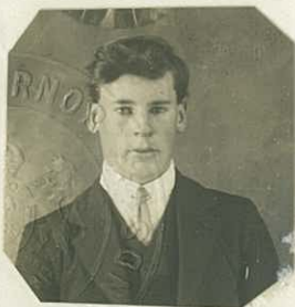
PHOTOGRAPH OF BEARER.