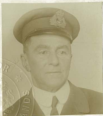
PHOTOGRAPH OF BEARER.

W. Douglas Young Governor, Falkland Islands.