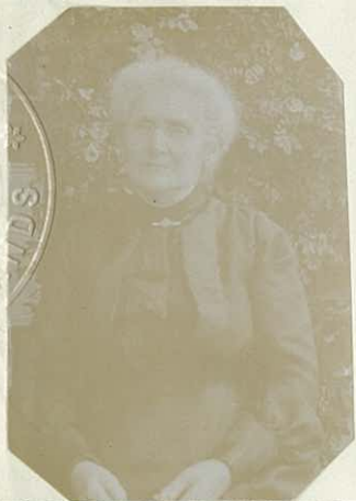
PHOTOGRAPH OF BEARER.