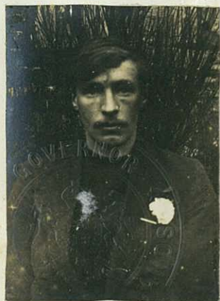
PHOTOGRAPH OF BEARER.