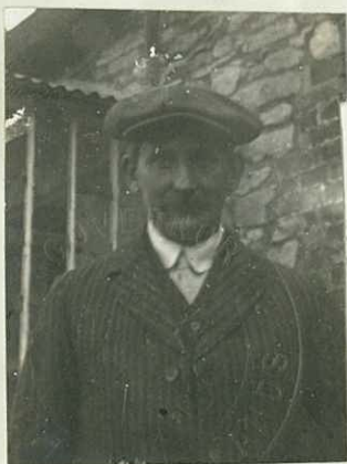
PHOTOGRAPH OF BEARER.

Given at Government House, Stanley, Falkland Islands, this 17 th day of June 19 19 . W. Douglas Young Governor, Falkland Islands.