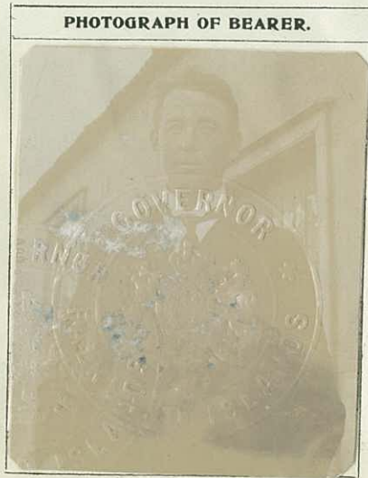
PHOTOGRAPH OF BEARER.