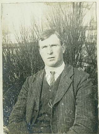
PHOTOGRAPH OF BEARER.