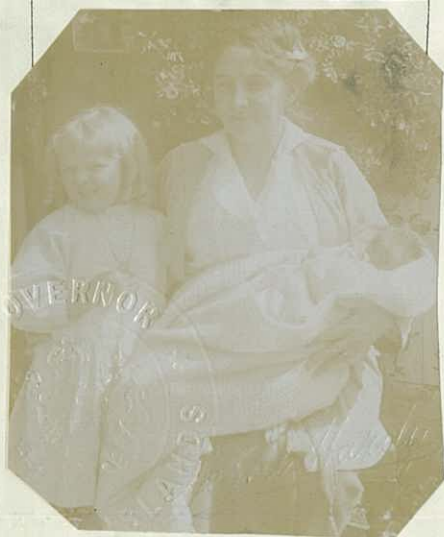
PHOTOGRAPH OF BEARER.