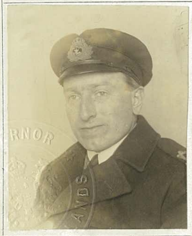
PHOTOGRAPH OF BEARER.

W. Douglas Young. Governor, Falkland Islands.