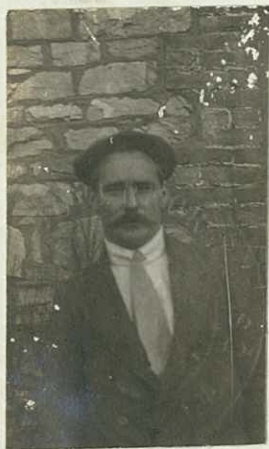
PHOTOGRAPH OF BEARER.