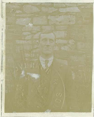
PHOTOGRAPH OF BEARER.