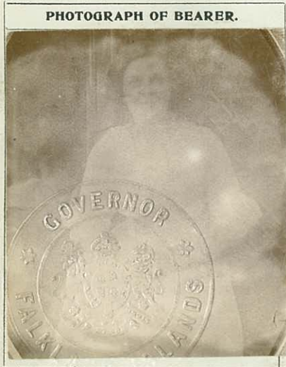
PHOTOGRAPH OF BEARER.