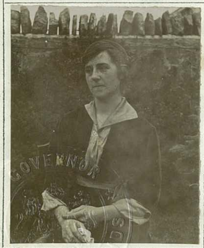
PHOTOGRAPH OF BEARER.