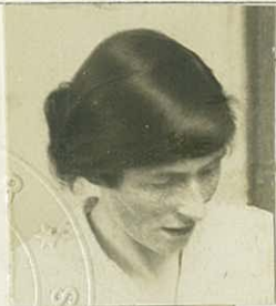
PHOTOGRAPH OF BEARER.

W. Douglas Young Governor, Falkland Islands.