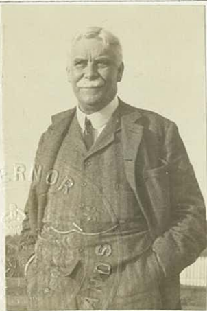
PHOTOGRAPH OF BEARER.

W. Douglas Young. Governor, Falkland Islands.