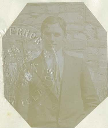
PHOTOGRAPH OF BEARER.