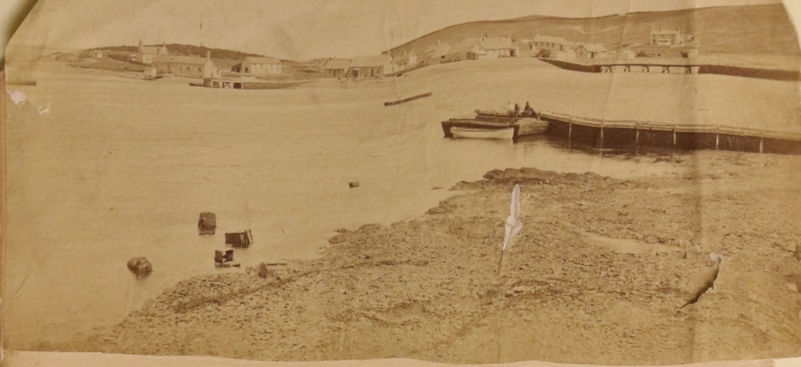
Darwin circa 1899