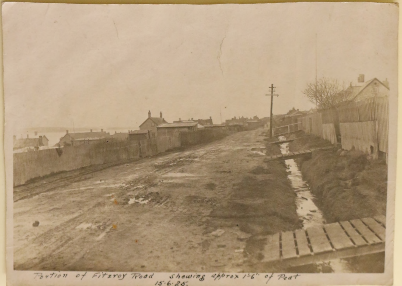
Portion of Fitzroy Road showing approx 1'6" of Peat 15-6-25