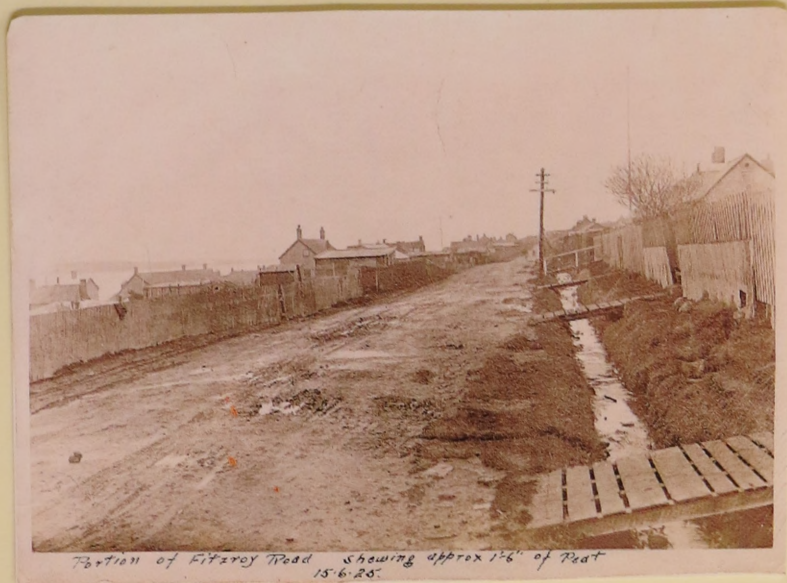
Portion of Fitzroy Road showing approx 1 1/2' of Peat 15.6.20.