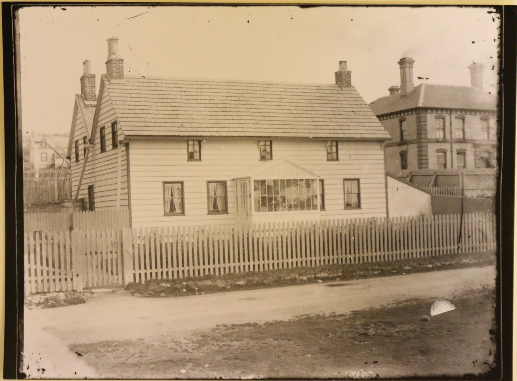
Tejo Cottage & Stanley House