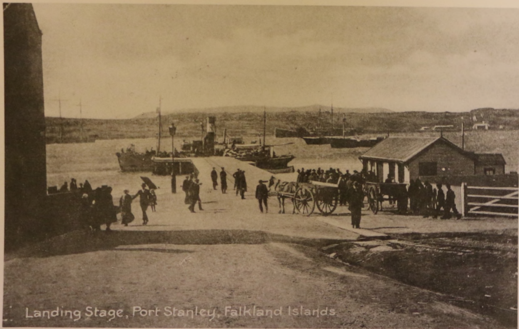
Landing Stage, Port Stanley, Falkland Islands

Sailing ship "Nor" a Norwegian whale factory at left. Whole catcher at jetty thought to be the Ornen. The Great Britain is partly hidden by a PSNC cargo vessel (Junin or Potosi) loading wool. Inshore from the Great Britain is schooner Lafonia and further inshore is the hulk/lighter Nimrod. New Customs Shed in place. (circa 1907-1909)