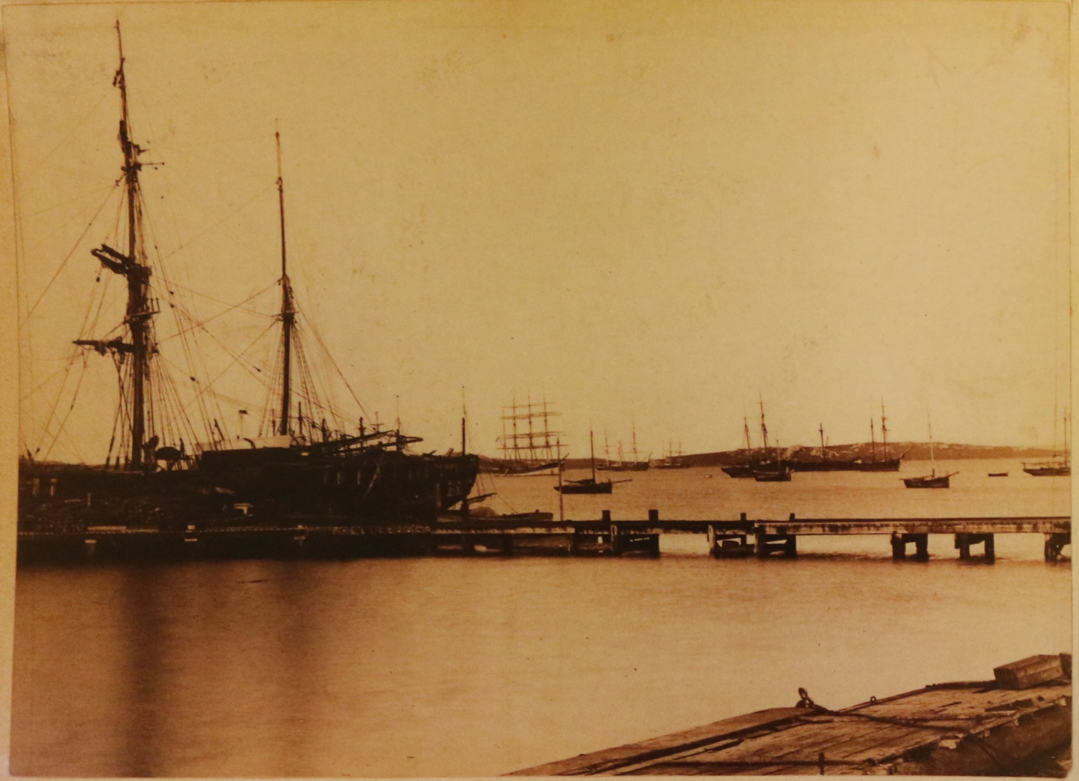
Dean's Jetty with Bidson Hill, Talisman & Gem.