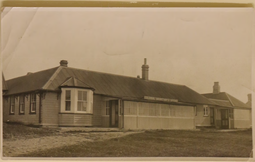
Colonial Secretary's Office, "The Offices" site of Secretariat