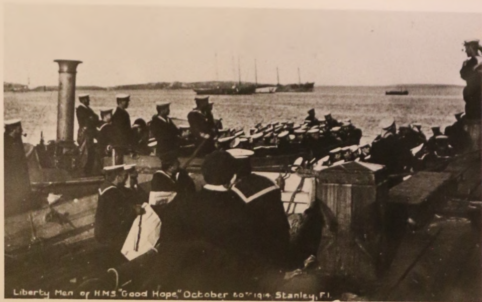
Liberty Men of HMS "Good Hope" October 20, 1914, Stanley, F.I.