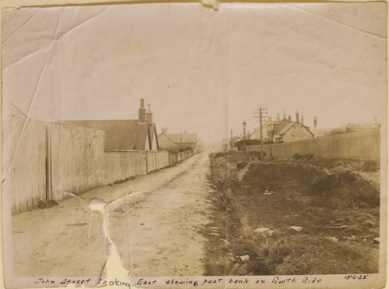
John Street looking East showing peat bank on South Side 15-6-25