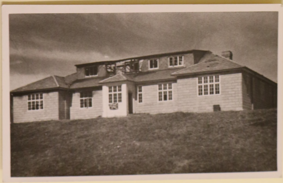
Secretariat after the fire of 9 March 1959