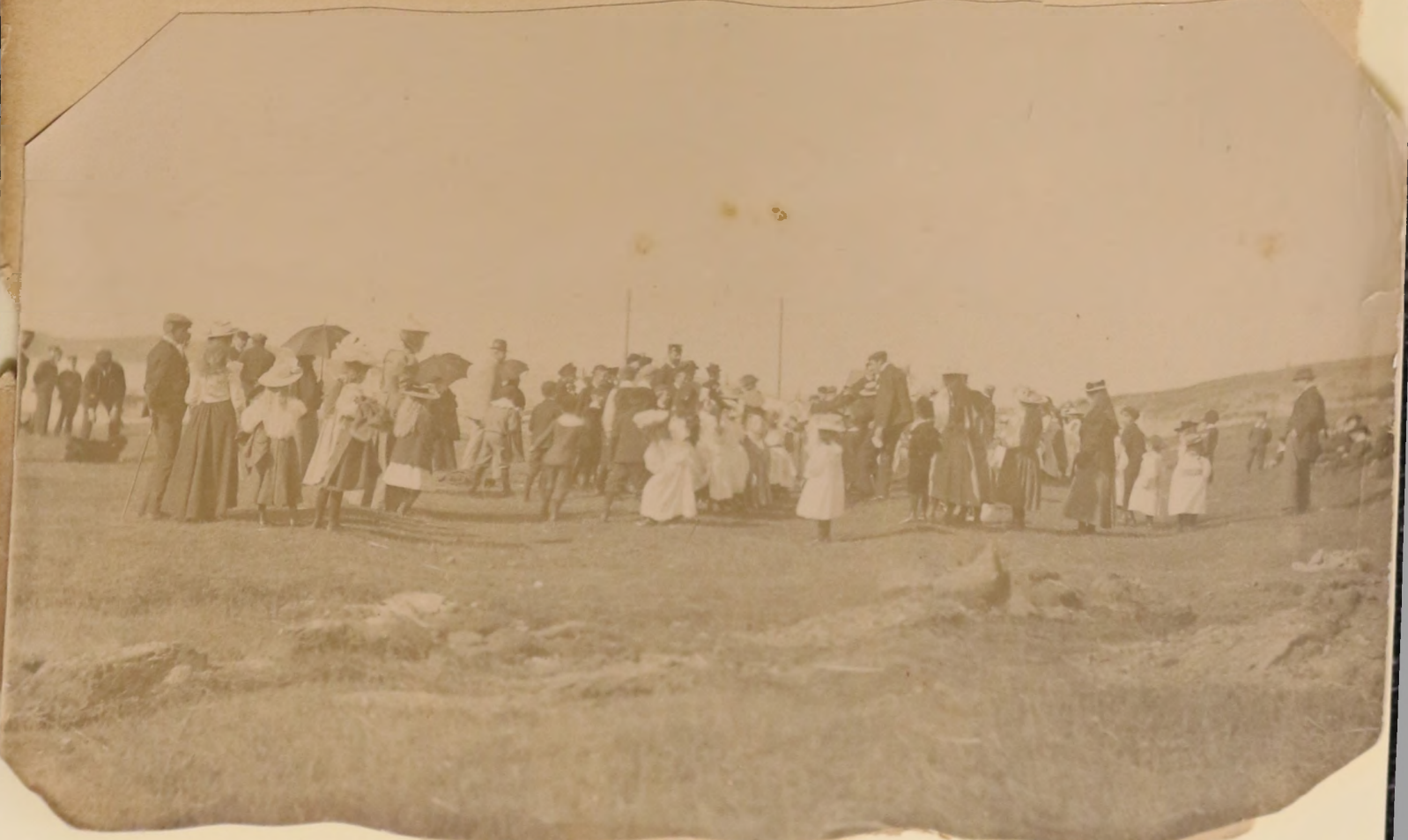
Sports meeting circa 1899. Stanley?