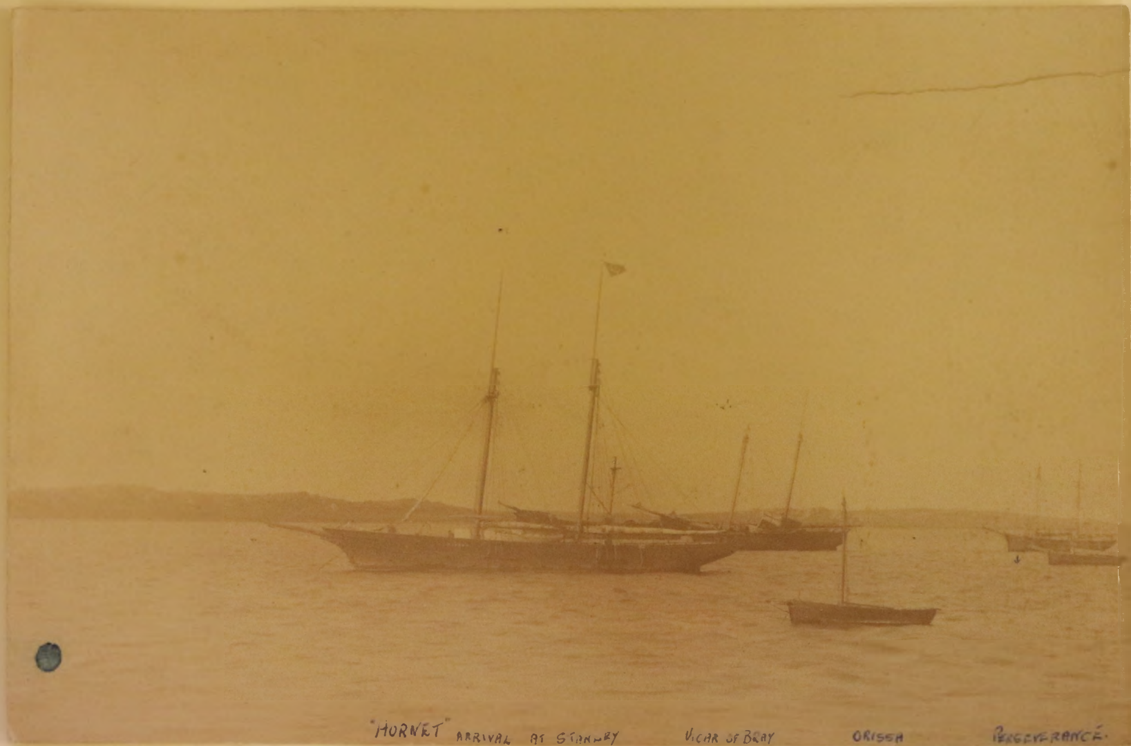
"HORNET" ARRIVAL AT STANLEY

Arrival of the Hornet at Stanley. 3 November 1882