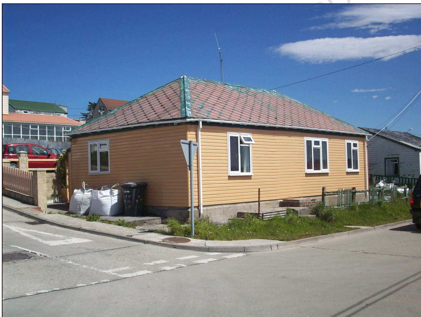
16 St Mary's Walk 2017