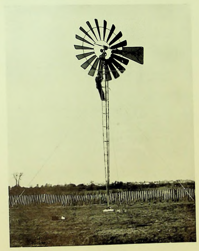
No. 1 MILL

When these mills are used, water for household requirements, etc., may be pumped by means of a small electric pump with motor, operated from the battery, and placed where most convenient for the well. This duty must of course be taken into consideration when determining the size of the mill.