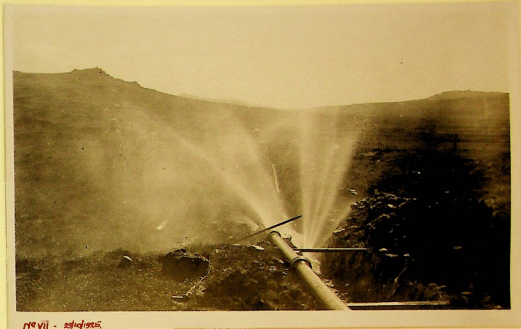
no VII - 23/10/1925